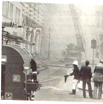
NOTE: You may make photocopies of these photographs for classroom use (but please note that copyright law does not normally permit multiple copying of published material).