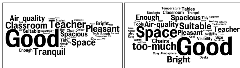
Figure 2. Word clouds of prevalent characteristics of an inspirational and motivational learning space. Left: The most common terms from the male students' descriptions. Right: The most common terms from the female students' descriptions.

The spatial basket included metric features (e.g. volume, access, route, distance and layout). Air quality, temperature, visibility (lighting) and audibility (soundscape) belonged in the sensory basket. The social basket included teacher–student interaction, instructional methods, group size, number of students in the school, school atmosphere as well as the calm/restlessness and tidiness of the place. The instrumental basket included equipment, the quality and reliability of tools, and practical and ergonomic considerations regarding the desks and chairs.