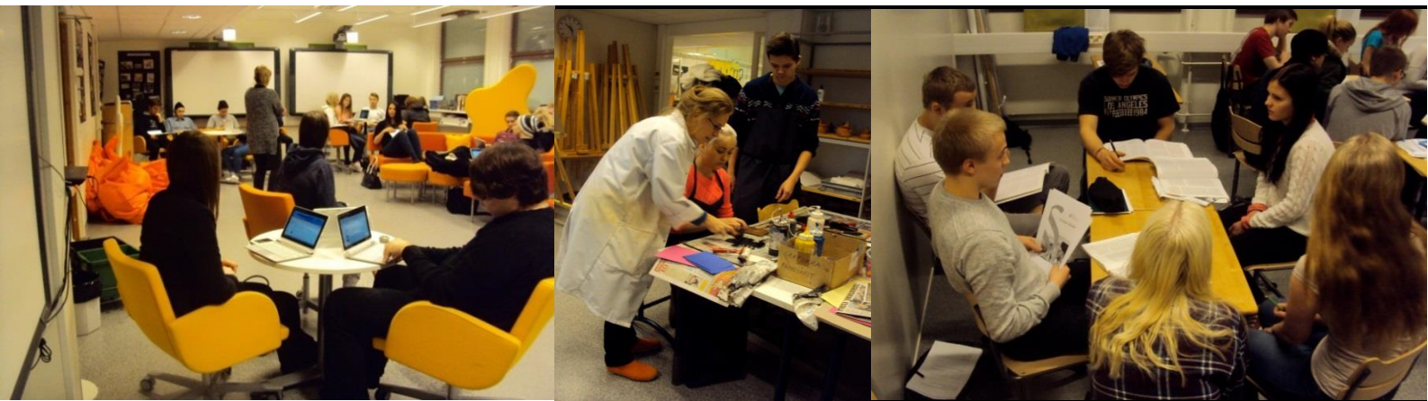
Figure 1. Learning situations differ in terms of space, participants, processes and tools. They include individual work, teacher–student interaction and student–student interaction, group work and one-to-many communication (when the teacher or a student is addressing the whole class).

Similarly, we asked the informants to assess a second list of 19 features using a negative lens, that is, whether or not a particular feature made learning more challenging. This task yielded a characterization of the features from the opposite perspective.