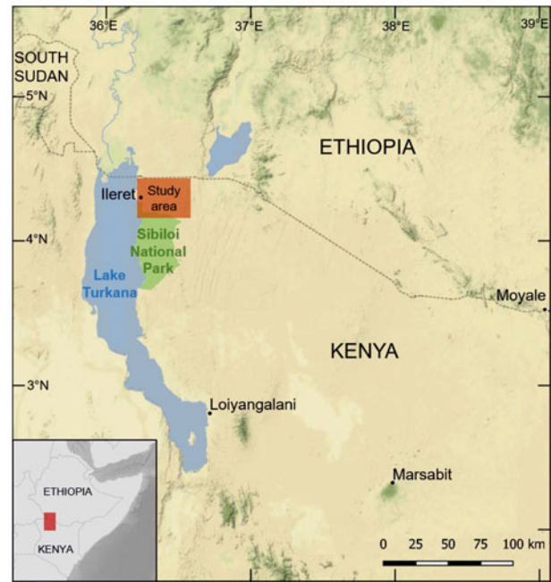
FIG. 1 Location of the study area in north Kenya, adjacent to Sibiloi National Park.

Here, we bring into focus the existence of a biocultural conflict in a traditional coming-of-age ceremony, the Dimi