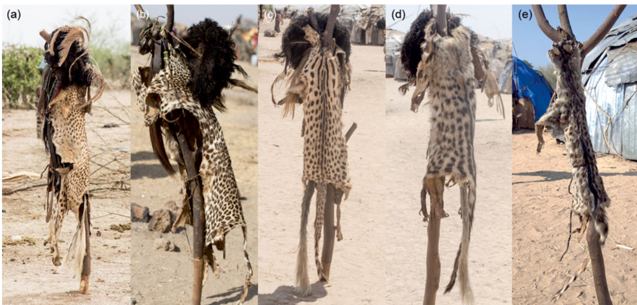
PLATE 2 Skins of species used in Dimi ceremonies: (a) cheetah Acinonyx jubatus , (b) leopard Panthera pardus , (c) serval Leptailurus serval , (d) African civet Civettictis civetta , and (e) common genet Genetta genetta , with ostrich Struthio molybdophanes feather headdresses (a–d).

common genet Genetta genetta and serval Leptailurus serval (Table 1, Plate 2c–e). Most (83%) of the cheetah and leopard skins were old, whereas most (64%) of the civet, genet and serval skins were fresh (Table 1).