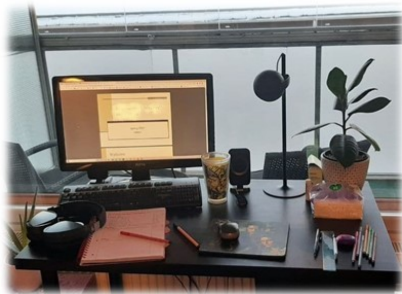
Figure 2. Picture from Student 5's written reflection, depicting one's home workspace.

“I usually keep my like my workspace my physical desk clear of any distractions [...] It's nice because it's right in front of the window so I can see outside [...] that there is a world outside of studying.” (Student 5)