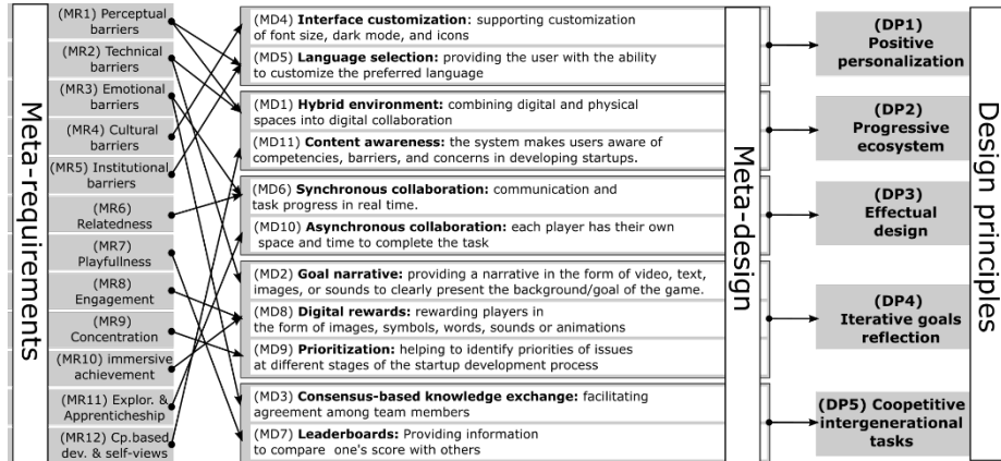
Fig. 2. Overview of design principles for IKS systems.