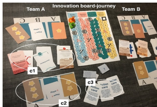
Fig. 3. Paper prototype meta-design for IKS system. C1: topic cards to achieve consensus; C2: rating cards by the player; C3: action-cards instruction for the player to pick a topic for discussion.

The content of the game relates to the competencies, obstacles, and challenges of entrepreneurship in digital startups to reflect the increase in topics related to entrepreneurial universities [13, 18, 21]. A collaboration narrative was developed in which each team had to collect one hundred points based on team members' consensus on the importance of a discussion topic related to competencies, obstacles, and challenges in specific innovation processes (four innovation processes: ideation, matching, design and development, and commercialization) [18]. This cumulative score is divided into four sections, each representing the four innovation activities. Consensus can be reached when the team draws an action card that presents three topics for discussion (each member gives a score, and after everyone is done scoring, the game displays all the answers and compares whether there is consensus or not). The more consensus is reached, the fewer action cards are removed, and the faster a team finishes the game, the fewer action cards determine the best team to finish the game.