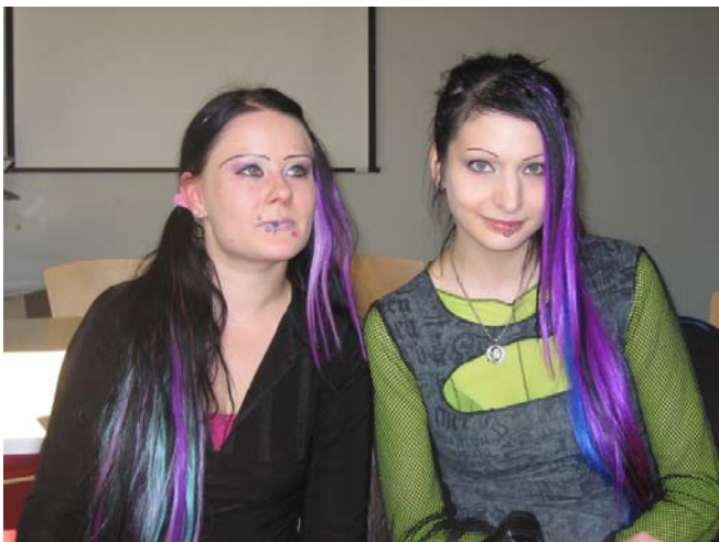
PICTURE 15 Female cybergoths