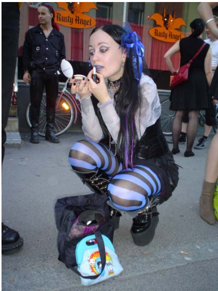
Picture 21 Girl getting 'Gothed-up'