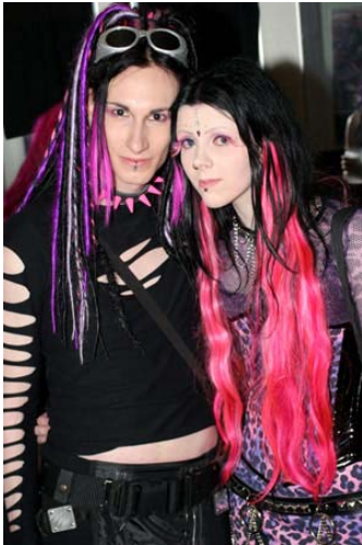
PICTURE 16 Cybergoth couple

and 'goggles' (www 29, see PICTURE 16) are common characteristics of the cybergoth style.