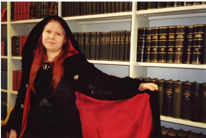
PICTURE 6 Girl with coat