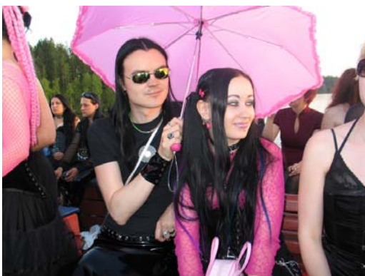
PICTURE 7 Couple with parasol

They are very trendy now, it is such a new fashion thing, everybody asks ‘where did you get them from, how did you make them’?