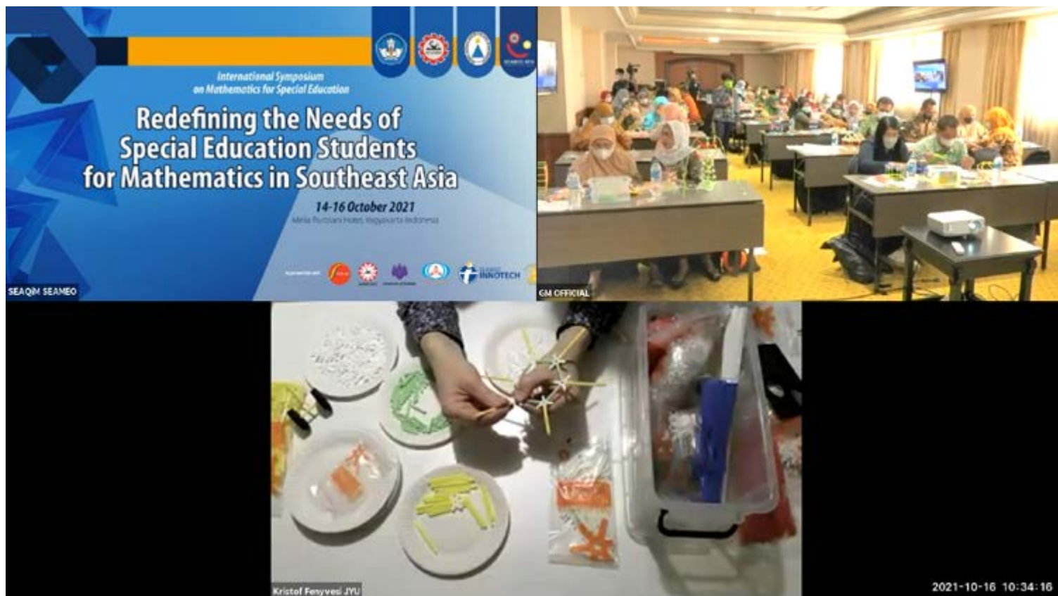
Figure 4: Zoom screen showing participants building 3-dimensional models with 4Dframe STEAM toolkit together with the online facilitator. On-site facilitators are supporting the process.

Hybrid and online sessions with physical activities were implemented as part of the same programs when all participants and facil-