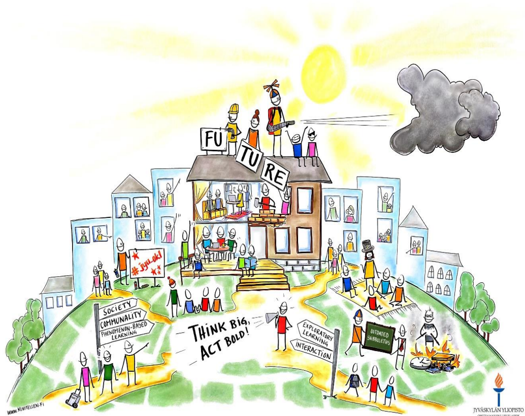
Picture 1. The Department of Teacher Education's vision of teacher education at the University of Jyväskylä.

The development work focused especially on the concepts of society, communality, phenomenon-based curriculum (and learning), exploratory learning and interaction. Picture 1 depicts this culture as utopia. The orientation towards the future is central in all development activities, strongly reflecting the idea of teacher education from the idea of utopian education, including both utopian thinking and attempts to make utopia possible through different experiments.