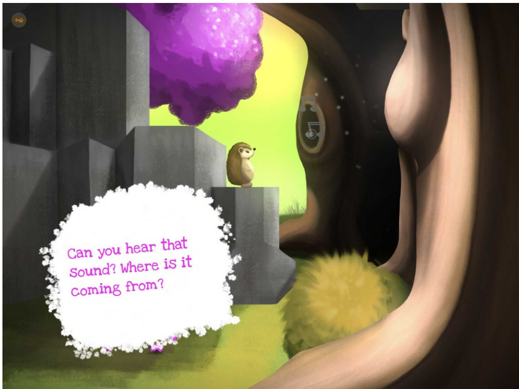
Figure 2: Addressing and instructing the user in Heston Hogs: The Way Home .

During his journey, Heston encounters different animals and challenges. Many of these interactions and tasks engage the user in various ways while the text addresses its reader in multiple places, asking them to help Heston or finish small tasks. For instance, in a scene where Heston is chasing a dragonfly, the narrator asks the user to tap the characters to affect their movement. This kind of addressing invites the user to identify and empathize with the young hedgehog; when Heston is hit by a thunderstorm, the user needs to give him a gentle stroke for comfort. In many scenes, the story does not continue without completing the tasks, such as tapping the right hotspots, finding objects, or swiping the screen. Only a limited and inconsistent amount of directions is given; in some scenes a dot appears on the screen to direct the user, but in other scenes the user needs to find the solution without assistance (see Figure 2).