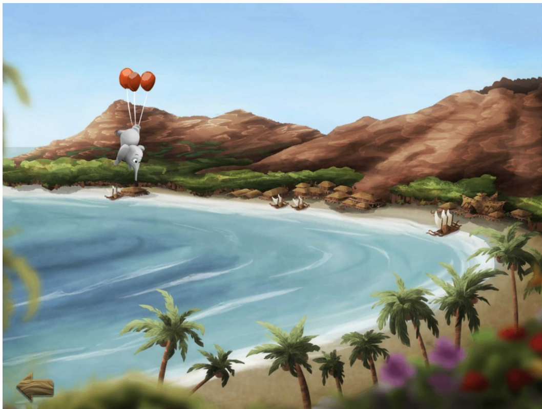
Figure 4: One of the landscapes in 3 Red Balloons.