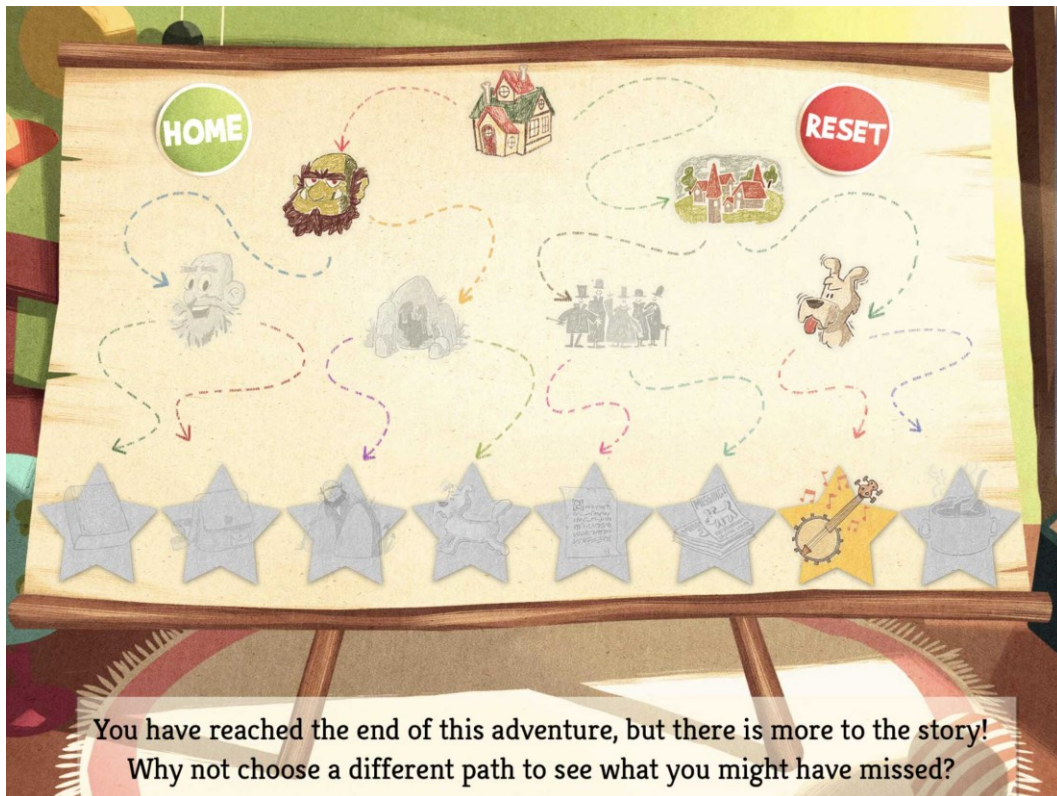
Figure 1: The map in Max & Meredith: The Search for Percival.

The logic of choosing between different storylines is rather simple, with two options popping up regularly as the story progresses. The user can also explore a map that visualizes the structure of the alternative storylines (see Figure 1). Although the user is free to choose between different options, the app directs the user towards exploring the different storylines and finding all eight endings. The technical rules of use are simple, and a child user is likely to be able to navigate the app quite independently or, alternatively, with an adult reading aloud. In addition, going through all different storylines unfolds the story in a way where each branch complements each other. This dynamic reflects the play experience of exploration–discovery in Songer and Miyata’s (2014) model.