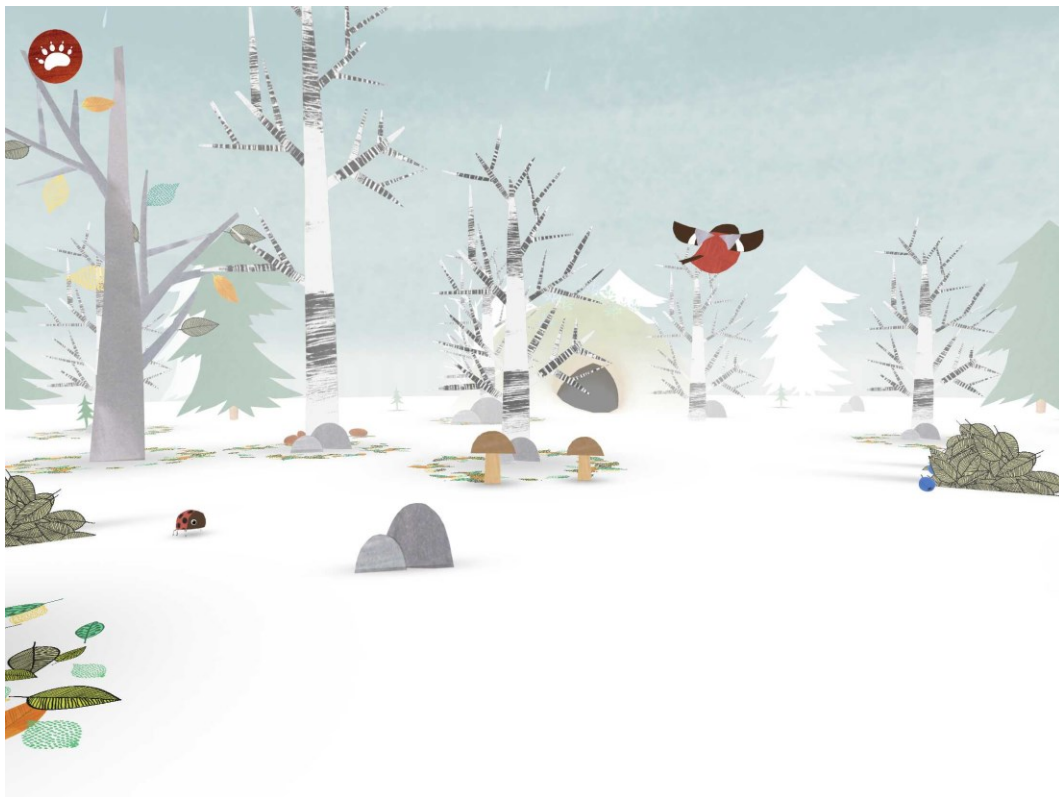
Figure 6: An immersive AR scene in the Mur app.