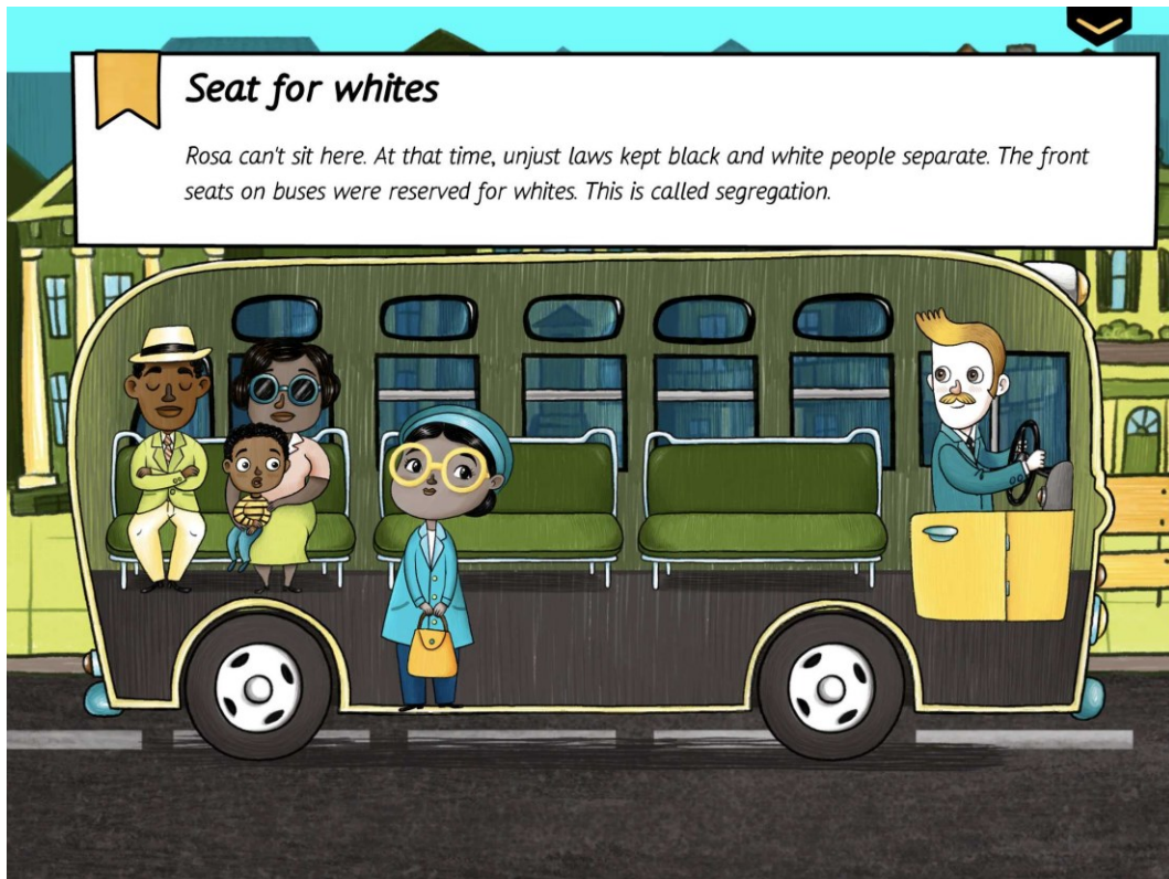
Figure 3: The bus scene in Women Who Changed the World.