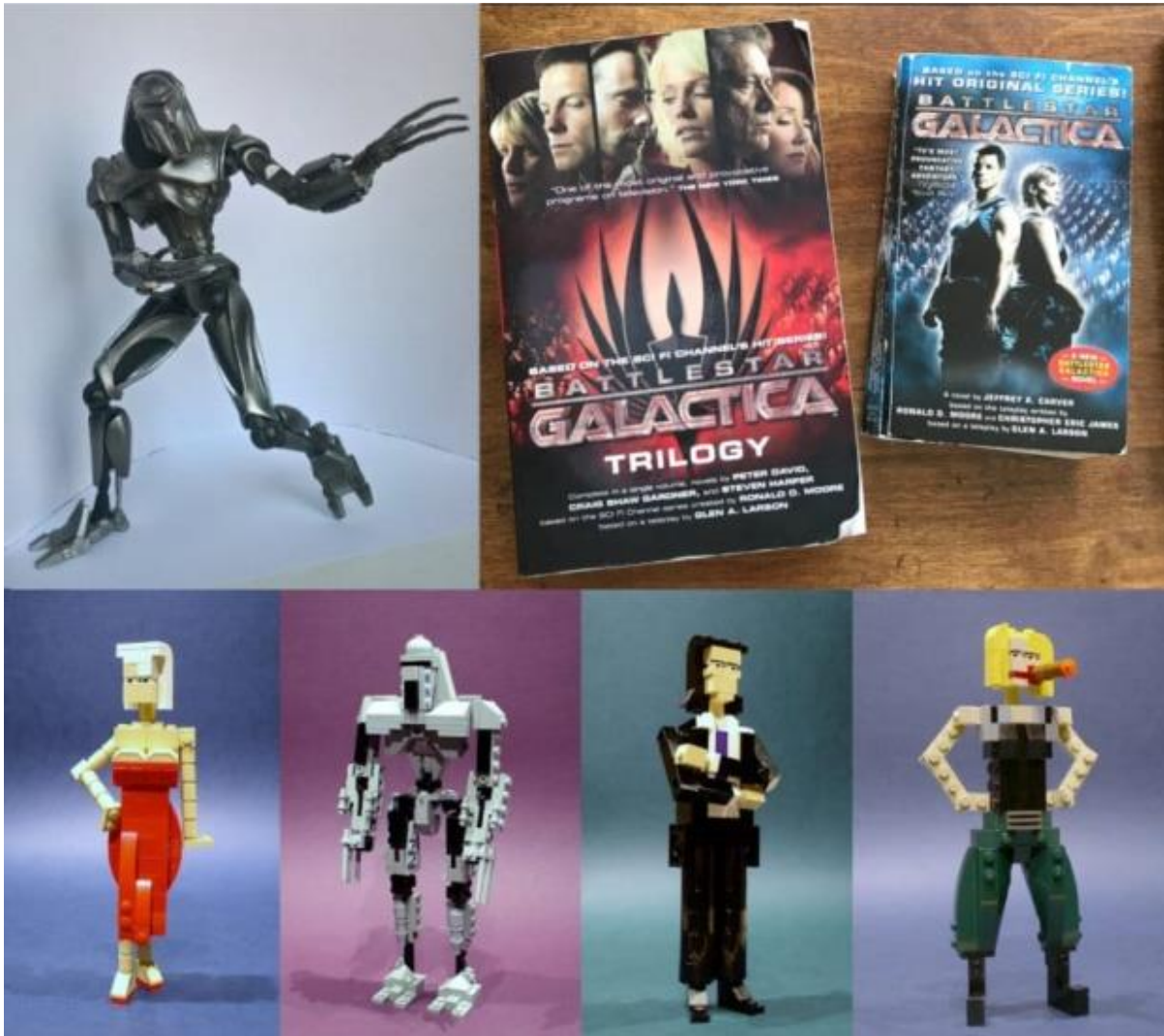
Image 3. Examples of the BSG universe, including both official and non-official content. Lego characters by Ochre Jelly.

Outside the BSG transmedia universe, an example of this type of construction can be seen in how audiences engage with The Hobbit film trilogy, based on J.R.R. Tolkien's book. Even though the book and the films are not transmedia in that they would create a coherent storyworld (cf. Jenkins 2006; 2011), audiences' experiences with the book and the films are often expressed as engagement with a broader "Tolkien universe" that also includes various transmedia productions, like user-generated content, visits to filming locations, or events such as queuing for the films (Koistinen, Ruotsalainen and Välisalo 2016, 361–366). Shifting the focus to transmedia users thus brings new perspectives to analysing how transmediality is as much a construction created by audiences as it is a creation of the official franchise.