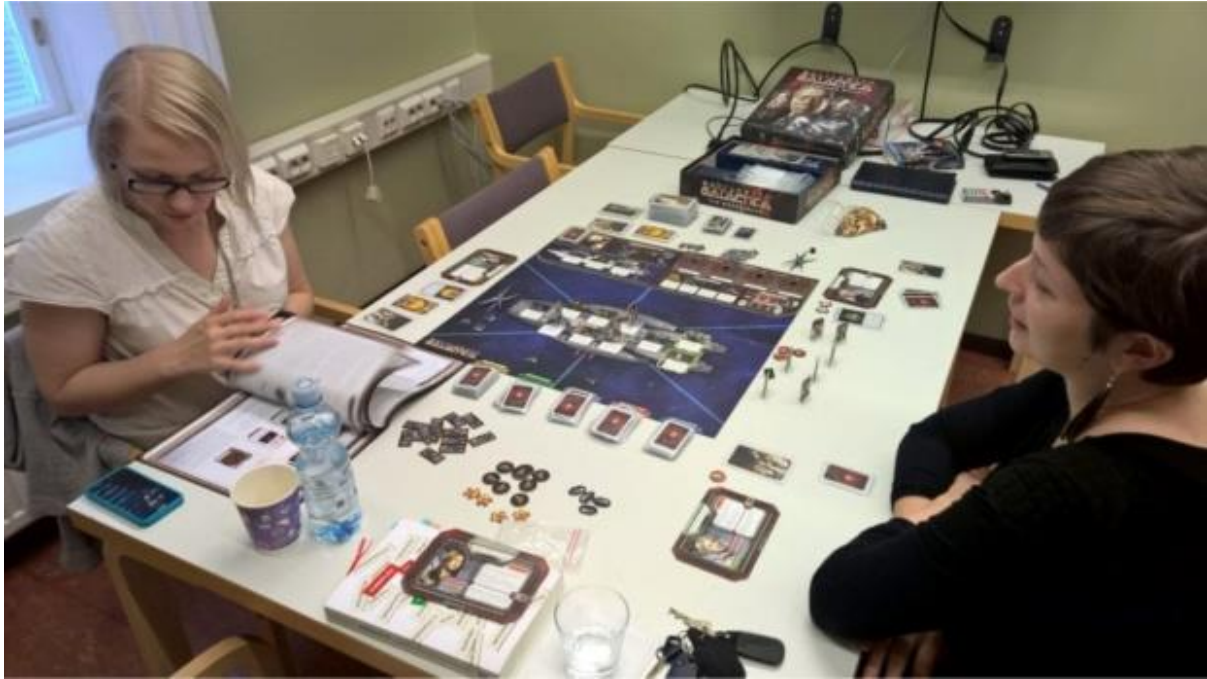
Image 2. Playing the BSG Board Game.