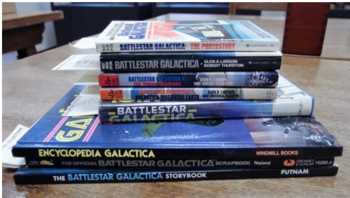
Image 1. Transmedia extensions created around the original series (San Diego State University, Special Collections, Science Fiction).

also spawned an ample amount of transmedia expansions (see Image 1), such as novels, a “storybook” with pictures, a scrapbook, an encyclopaedia, games, comic books, toys and user-generated content. There is also an extensive fan-made online database called Battlestar Wiki that deals with both the original and the reimagined BSG franchise. We consider all of the aforementioned content as part of the BSG transmedia universe (for an overview of the universe, see Table 1).