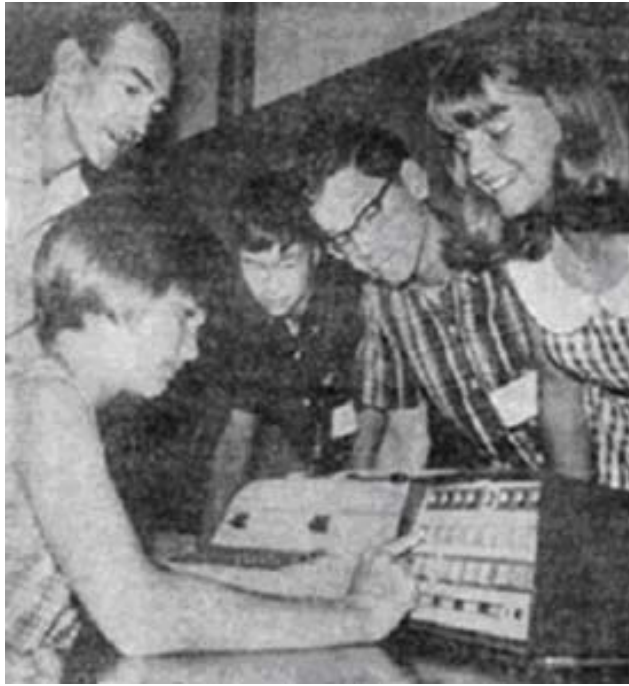
Figure 2. The author (top right) and the Monroe Monrobot School Computer [ Fort Worth Press newspaper, 1966].

From Morse code to typewriting, I hear the clicking even now as my mother typed my father's Master's thesis in triplicate during the summer of 1966. I think it was an old Underwood. In that same summer of 1966 I was chosen to participate in a special summer program for gifted junior high students in math and science. During this program, I learned to use a machine they called a computer. Actually, it was called the Monroe Monrobot School computer. Over the next few years I excelled in math subjects, but I really wanted to write poetry.