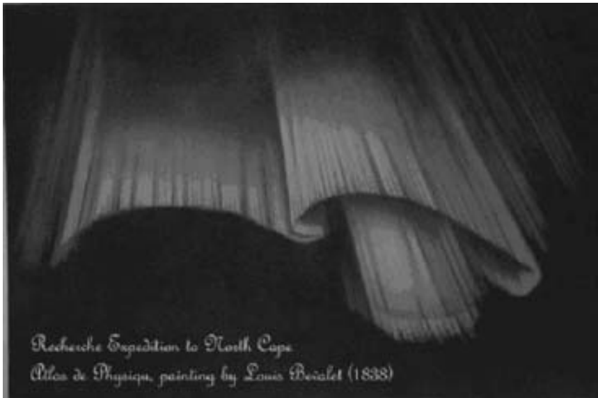
Figure 3. Painting by Louis Bevalet.

In 1892, Gerhard Munthe (figure 4) titled this painting “Suitors, Daughters of the Northern Lights,” and we see polar bears ( isbjørn ) entering the daughters’ bed chamber, licking their feet in a posture of worship, remnants of earlier folklore and mythology. Among the circumpolar indigenous people of Nordic regions, some say that the auroral halos are the dancing souls of dead virgins, or old maids waving their mittens. Some believe the “mystical veils” are still-born children playing ball with their afterbirth. Icon of the threshold between life and death, arctic virgins signified liminal figures characterized in Norse mythology as the Norns, and later the Valkyries, goddesses who determined the destinies of kings, who chose the slain and escorted them into Valhalla, the hall of Odin. In Finland, when the auroras filled the sky, they said “the women in the north are hovering,” or “the old women in Pohjanmaa are hovering over Konnunuo” (the place where dead virgins lived) (Brekke 1997, 43).