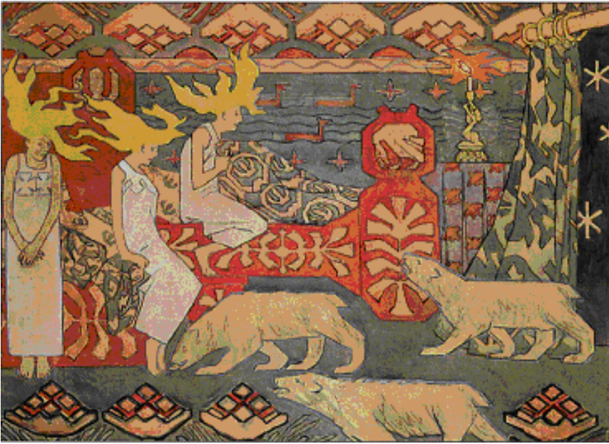
Figure 4. Sutors, Daughters of the Northern Lights by Gerhard Munthe.

and chaos, to view them as Lilith or the Whore of Babylon, and sometimes to elevate them as representative of a higher and purer nature, to venerate them as Virgins and Mothers of God” (Moi 1985, 167). So, the whitewash is not over. Yet Kristeva’s desire to release the unrepresentable marks but a tear in the veil of representation. Her call to abandon representation pales when juxtaposed with her all-too-brief review of color in “Giotto’s Joy.” In her analysis of Giotto’s paintings in the Arena chapel in Padua, Kristeva explains that his particular use of colors, especially a “luminous phosphorescent blue,” signifies a break with Byzantine tradition and the dogma of the church that controlled ‘representation’ itself. She suggests that color is not restricted within the “strict codes of representation and verisimilitude,” as are form and space (Kristeva 1980, 226). As such, “[c]olor translates an oversignifying logic in that it inscribes instinctual ‘residues’ that the understanding subject has not symbolized” (ibid., 221). “Color is the shattering of unity” (ibid., 221). It shatters the “dominion of One Meaning” (ibid., 224), in this case, the color white. It does not suppress light, but segments it with spectral multiplicity.