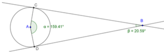
Fig. 1. GeoGebra applet in which one can drag points A and B (see https://ggbm.at/acMDDcae ).

The purpose of the task was to engage students in making observations, noticing patterns and generating conjectures through experimenting with dynamic geometry software and then explaining or justifying these through deductive reasoning. Thus, the task included aspects that are considered as important affordances of using dynamic geometry software in mathematics learning (e.g., Hähkiöniemi, Leppäaho & Francisco, 2013).