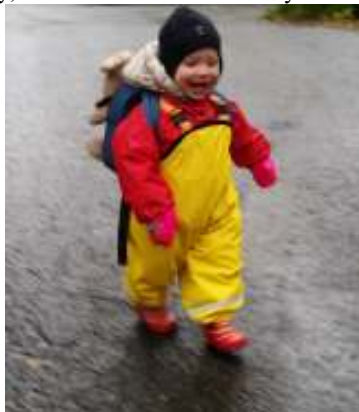
Picture 5. Raining is not an excuse to stay inside

Raining makes nice water ponds (water puddles) to jump in or over, attracts children to throw little stones or to carry the water to another place. Rain makes the sand in sand boxes an easy material to make sand cakes. Interestingly, children love to catch water drops in their mouths. When children have appropriate clothing allowing them to use their hands freely, the rain is no reason to stay inside. (Picture 5)