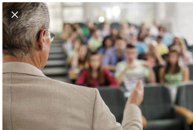
Fig. 2. Teacher Giving a Lecture in Amphitheatre.

In the Brazilian data, 24 students connected their professional dream to the idea of status. These illustrations and accompanying texts resembled the Finnish pictures in that the high-status job was connected with a sense of appreciation, success and belonging, whereas the less prestigious job was associated with non-recognition, failure and low status. Like the Finnish students, the Brazilian students wanted to secure a respected position in the system, and they associated ideas of social recognition, wealth and appreciation with certain professions aligned with the wider discourses of class and social power in society (Bourdieu, 1986; Darvin & Norton, 2014). In the Brazilian data, the socio-political context was visible in that no participants focusing on professional status considered primary or secondary school language teaching an option. Rather, in the Brazilian context, the students envisioned becoming university teachers or some other high-status professionals. As in the Finnish data, this is contrasted with doing some kind of manual work, but more prominently also with either office