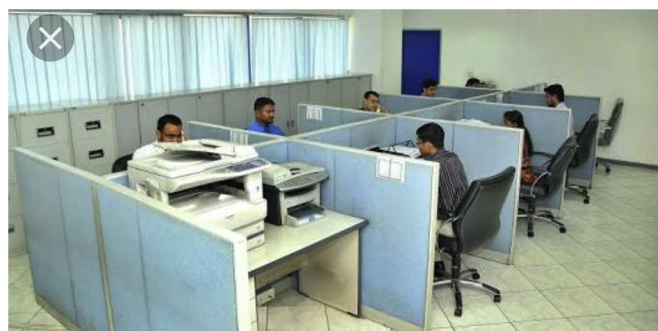
Fig. 3. Office Cubicles in Gulf Worldwide Sales & Marketing Team.

work or working as a teacher in the school system. Figs. 2 and 3 are an example of the seven illustrations that construct a contrast between the jobs of university teacher and office worker: