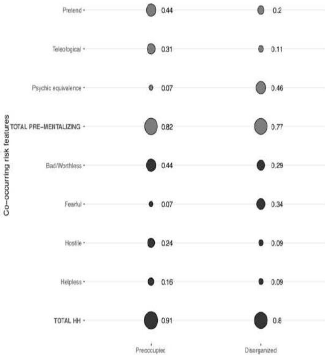
Figure 1. The co-occurrences of the Hostile/Helpless and the Pre-Mentalizing instances with the Insecure caregiving representations.