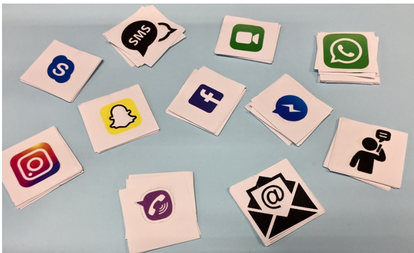
Figure 2. Cards depicting icons for mobile apps and other communication technologies, used to show family communication practices in family constellation collages.

In the Basic Taxonomy of Participatory Visual Techniques (Pauwels 2015), interviews, in which the study participants produce visuals and reflect upon them, are systematized as auto-driven visual elicitation. Pauwels points out the key advantage of this technique, which is to generate two types of data: visual and verbal. He indicates that any produced visual(s) should be also analyzed in addition to, and beyond, the comments provided by the research participants. Nevertheless, contrary to some other visual stimuli, an interactive collage technique is only meaningful when looked at in combination with participants' verbal narratives, accompanying the creation process, along with researcher's field notes compiled immediately after each interview.