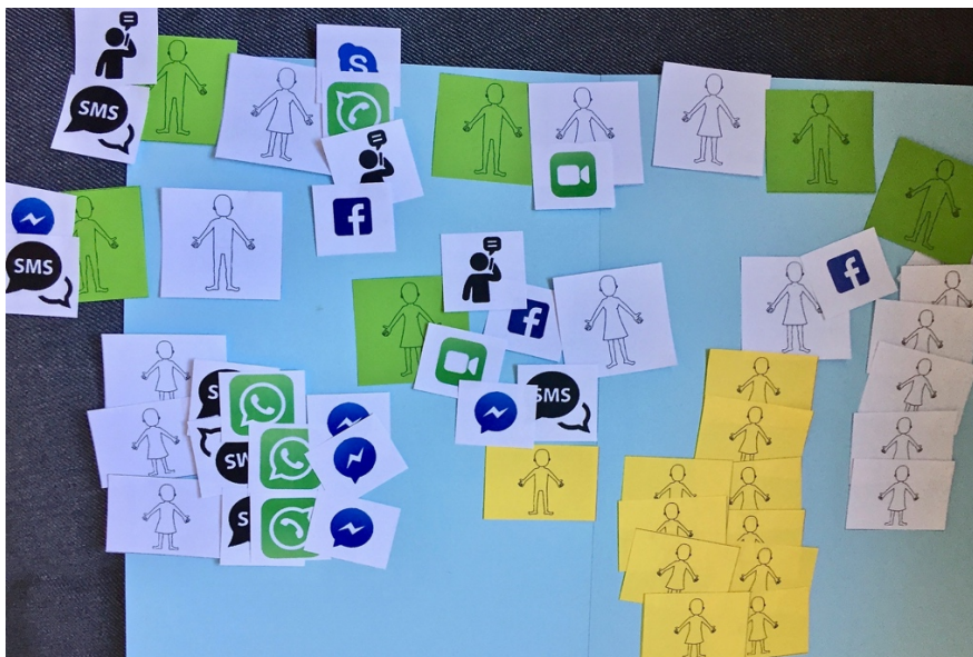
Figure 3. Beata’s family collage: In the centre are Beata, her husband (depicted as a female silhouette) and son; at right is her husband’s family: brother and sister, both with all children, and their parents; at left is Beata’s Polish family: her brother and his family and their parents.

However, some participants used them unrestrictedly, without paying any attention to matching the card’s gender to that of a family member. For example, one participant depicted her husband using a female silhouette card and silhouettes of girls to indicate a number, but not the gender, of children in her husband’s family (see Figure 3).