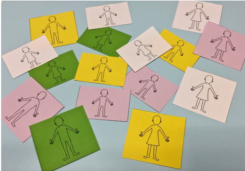
Figure 1. Cards depicting silhouettes of adults and children, used to create family constellation collages.

Edwards 2017). Sand- boxing is particularly useful when interviewing children, studying sensitive topics and exploring areas challenging to be verbalised by the research participants. A key aspect of sandboxing is the interactive mode, which enables a participant to rearrange the elements in their sandbox throughout the duration of the interview.