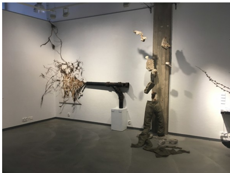
Figure 8: Participant 4 and 5's works, "Rauhaton/Impaziente/Restless" on the left and "Kuuluminen/Appartenenza/Belonging" on the right [58]

Although both works are independent, they settled in an interesting dialogue in the exhibition, where they were placed next to each other. In these artworks, the artists' personal experience and their trauma from the loss of home and second home can be seen as comparable to the general conflicts of the world and to other similar situations in which natural disasters, wars and conflicts destroy homes and drive people away from the places where they feel they belong. All these create homelessness, rootlessness and situations in which people struggle to belong.