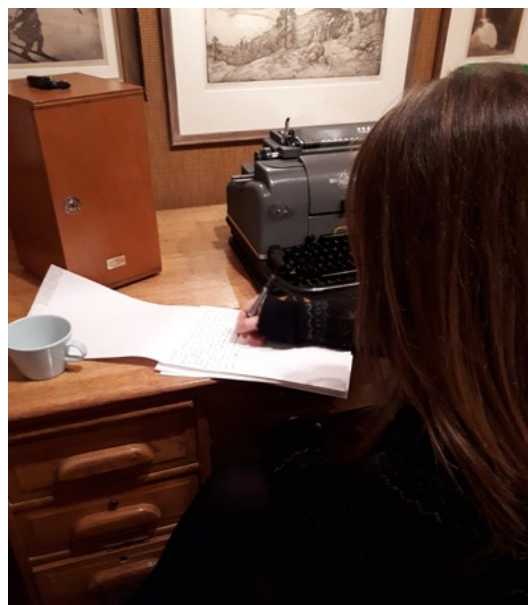
Figure 3: Individual work in the writing workshop [25]

The group worked dialogically and collaboratively, sharing ideas, feedback and thoughts, and helping each other to construct the final products. Help was provided in visualizing, filming and translating. As a result, short stories, visual and textual poems, autobiographical writings, sound and video poems, a filmic short story, a politically engaged video, paintings and sculptures were created. The meanings of belonging were further explored in the public events organized by the workshop. Two literary nights featuring the workshop participants' live readings and the premiers of the sound and video poems were organized as part of the workshop. The audience also had the chance to share their ideas on belonging. These events based on bodily presence enabled the participants to share experiences on a personal level.