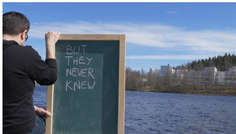
Figure 9: Participant 6's video (a screenshot) [67]

Art-making may not lead to answers, but it may offer an opportunity to process unaddressed aspects of one's life and open up spaces for others to pose their own questions. Participant 6's work suggests that the creative process is more important than the finalized work of art, providing ways of knowing what belonging is rather than knowledge about belonging.