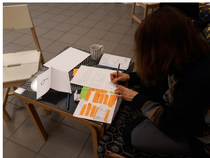
Figure 2: Ideation in the video workshop [22]

Seven of the participants finished their short films, the styles of which range from an experimental short film to a documentary that combines observational and participatory modes. The films' themes include the bodily sense of belonging, belonging through music, olfactory memories of home, belonging by learning to cycle, defending a doctoral thesis in order to belong to academia, adaptation to a new culture, and the feeling of non-belonging (HILTUNEN, 2019b).