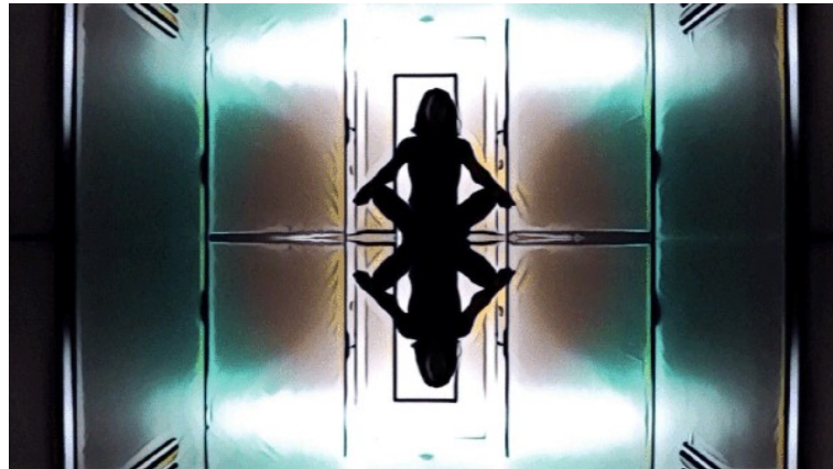
Figure 7: Participant 3's short film (a screenshot) [49]