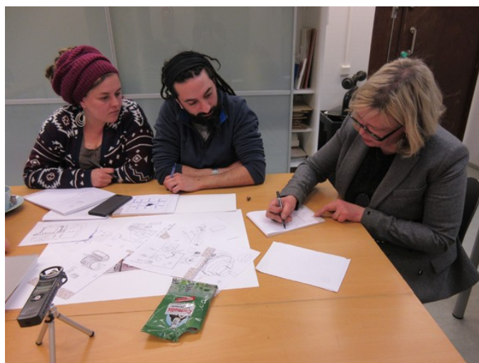
Figure 4: Collaborative work in the visual arts workshop [29]

In the visual arts workshop there was intense discussion about belonging, and the participants used various creative methods. The themes of belonging and non-belonging were approached from different angles, from personal feelings, experiences and different kinds of relationships to topical issues and conceptual examinations. Each artist participated in the exhibition, which included 11 works from this workshop.