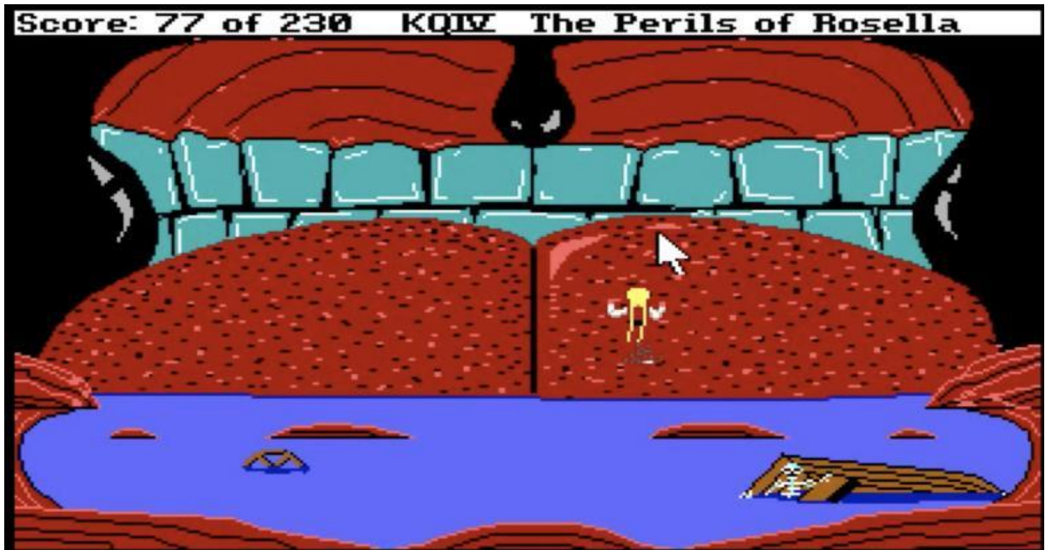
Figures 6 and 7. Rosella in her original environment (above) and the exposed setting with Patti and Larry (below). King's Quest 4: The Perils of Rosella (Sierra Entertainment, 1988), Leisure Suit Larry 3: Passionate Patti in Pursuit of the Pulsating Pectorals (Sierra Entertainment, 1989).