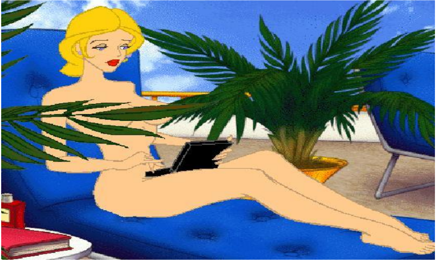
Figure 2. Drew Baringmore and the pesky branch. Larry 7: Love for Sail! (Sierra Entertainment, 1996).

In the history of adventure games more broadly and text adventure in particular, this vein of fun in riddling failure lines with their specific “frustration aesthetic” by the “art of error message design” (Douglass 2007). Such courting of failure on the way to unlocking the “correct” interpretation is also typical of sexual riddles, as Kaivola-Bregenhøj (1997, n.p.) observes: “One thing all sexual riddles have in common [is that] the right answer is always in a sense the wrong one”. The adventure game, in turn, has always relied on players needing to try out every single option and collecting useless objects (‘pathological kleptomania’) that generates constant failures and errors, typically making a fool out of the protagonist. Akin to this lineage, exploring conversation options by directly asking for sex in any Larry often results in scorn being heaped upon him and his overreaching aspirations. The fiction puzzle design, however, allows for and