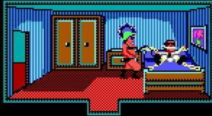
Figure 3. Larry and Barbie's mother; a "game over," that is. Leisure Suit Larry Goes Looking for Love (in Several Wrong Places) (Sierra Entertainment, 1988).

Adventure games let us expect that their fiction puzzles can be overcome, but the solution's surprise might equally involve circumvention or substitution. This ties in with relief theory (aka release theory ), which is best-represented by Sigmund Freud's influential approach. Namely, the build-up to laughter, for Freud (1905, 98), is geared toward some kind of release as a socially acceptable outlet for the "satisfaction of a drive [...] (be it lustful or hostile) in face of an obstacle in its way". This diversion of energy is most loaded in the case of what Freud calls "tendentious" jokes, which navigate and circumvent taboos and inhibitions, thus fulfilling a purpose and usually having an implied (more or less indirect) target. This, again, echoes Kaivola-Bregenhøj's (2017, 200) note on riddles: "When delicate matters are dressed in humor, youngsters learn to speak of them in a way that is socially acceptable."