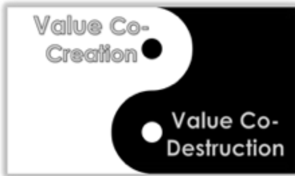
Figure 3. The complementary, interconnected, interdependent yin and yang nature of value co-creation and co-destruction of cybernized service use ( https://en.wikipedia.org/wiki/Yin_and_yang )

We foresee that this research will lead to further theorizing about the value creation process of cybernized service users and most importantly, looking at value co-creation