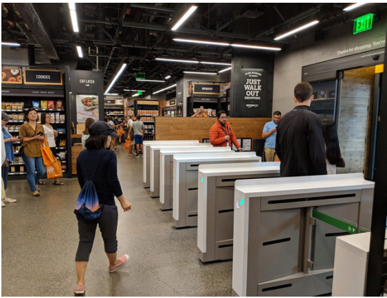
Figure 1. Amazon Go Store by Bruce Englehardt (top) and Sikander Iqbal (bottom), licensed under the Creative Commons Attribution-Share Alike 4.0 International license. https://en.wikipedia.org/wiki/Amazon_Go

items as the customer leaves the store, illustrating AI's seamless integration into organizational work routines and processes (Zijm and Klumpp 2017). In general, AI uses machine learning capabilities and natural language processing abilities to learn and implement computational intelligence that resembles human problem-solving abilities (Chen et al. 2012). Consequently, we contend that the increasing prevalence of AI in combination of a cyber-physical system heralds undeniably an era of cybernized services that are distinct from 1) human- and 2) digital-based services.