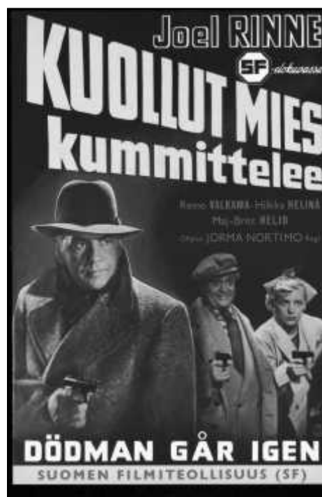
Photograph 1. Poster for the film The Ghost of the Dead Man Walks .

This 1952 film poster is also a time-door or time-gate through which it is possible to move back and forth from one present moment to another. This whirling hum of bygone days had ac-