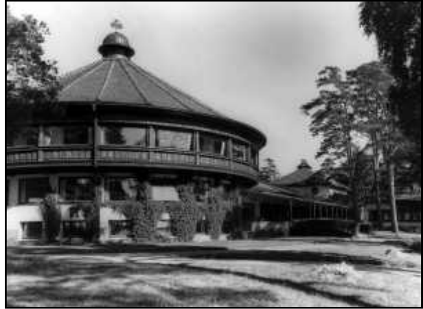
Photograph 2. Once, in the summer, at Kalastajatorppa.

As I climb the steps and enter the building, the words of the Muonituslotan käsikirja (Provisioning Lotta's Handbook) well up in my mind. They link up with the question of mealtime taste which I have posed and have been thinking about. The book had originally been published as long ago as 1928. The fifth impression appeared in 1939. How we present or provide a person with the opportunity for mealtime taste is no small matter: "Food fulfils its purpose only when during its eating it is capable of awakening and sustaining the appetite. It is by no means the case that only food that