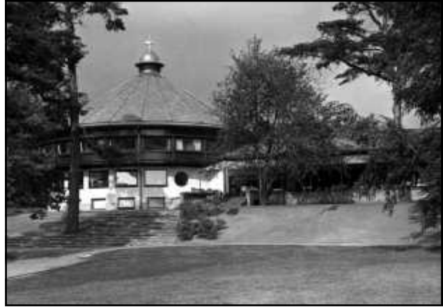
Photograph 6. Back to the beginning.

I have once again passed through a time door and arrived in an outdoor space that is verdant, leafy and filled with the scent of pine. I am at the intersection of time levels. What we have is a moment of tastes, tastes of epoch-making periods and turning points. The thoughts about eternity expressed in the work Dream Journey befit an examination of this stratified present. Is the time of tastes the sum of all present moments, then, or a totality constructed of tiny fragments of eternity? Are we capable of somehow expiating the evil events of wartime and expunging them? And can we think that nobody can deprive me of this jackpot of taste that marks this age? Is Kalastajatorppa time concave or convex in character?