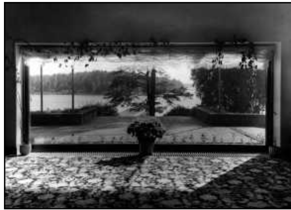
Photograph 3. Fenestral art.

I’m standing inside Kalastajatorppa and looking out on a scene of simply breathtaking elegance: a fenestral work of art. Seeing harmony arouses the feel-