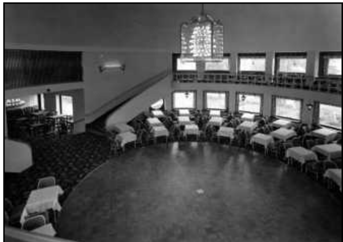
Photograph 4. A time of life's rings.

The circular dance floor is like a metaphor for life's circles where each passing decade has left its groove. That symbolic disc of being also includes Kalastajatorppa's cinema age or its cinematic period. That time is in no way vanishing, rather it is there in the light, nimble steps of all those generations of dancers, present and future.