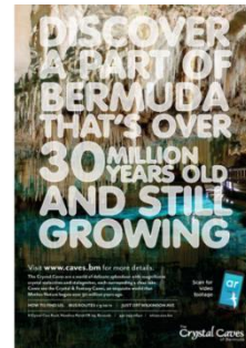
Fig. 2. Augmented print examples study participants experienced

Then, the third part of the questionnaire asked respondents about their experience with Layar and if they would like to use augmented reality sources such as the ones they just experienced in order to search for travel related information. They were asked about cognitive aspects looking at the augmented application usability, i.e. application design, application utility, interface in- and output and interface structure [19], affective aspects, i.e. enjoyment [32], playfulness [33], and entertainment [34]. Further, people responded concerning their experience with regards to action and emotional responsiveness [35]. Finally, they expressed their intention to use an augmented reality app in the future [36]. Table 1 provides an overview of all the items used. As an answer scale for all those items a 6-points Likert Scale from 1 (strongly agree) to 6 (strongly disagree) was used. The fourth and final part was about demographics.