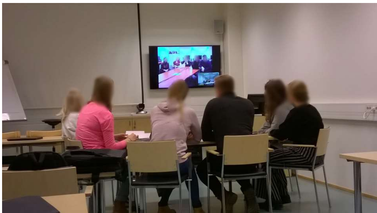
Figure 4. Videoconference between students from the University of Pardubice and the University of Jyväskylä in 2018.

In 2018, for example, the students explored and compared the role of English in Finland and in the Czech Republic. For my students, this was an assignment for the Sociolinguistics course, while the Czech students completed it for their Business English course. Two closed Facebook groups were created, each with 10–12 participants (e.g. 5 Finns and 7 Czechs). After some introductory and warm-up tasks, the students worked in pairs to collect and compare real life evidence for the use of English in a sociolinguistic domain (catering, media, advertising, tourism etc.) of their choice. The pairs summarized their findings in presentations (format freely chosen by the groups) that were shared before the room-based videoconferences (see Figure 4), where the students discussed the findings.