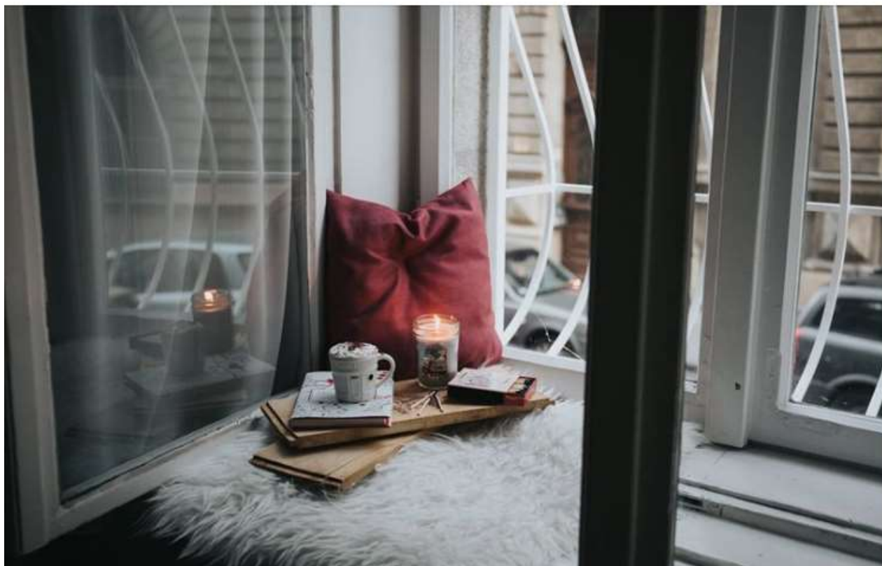
Figure 2. Teacher's instruction shared in the joint social media platform. VE between Waseda University and the University of Jyväskylä, 2018 autumn.

Your teachers decided to extend the deadline for the pairwork assignment until 4 December. 😊 We understand that some of you are busy with your studies at this time of the year. Make sure though that you keep in touch. Enthusiasm and good communication can help a lot! Just a reminder for my students: we are having an online meeting tomorrow at 4 p.m. See you then!