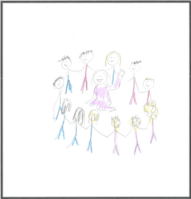
Figure 3. A joint activity in a classroom, involving both the teacher and her pupils (originally in full colours).