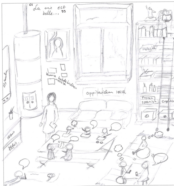
Figure 5. An English class of Nea’s dreams (originally in black-and-white).

Nea would not give the English class of her dreams in a traditional classroom but in a modern one (preferably in a romantic/fancy mansion, close to nature), furnished so that students could sit at desks, on a couch or comfortable chairs, or lie on the floor, either working on their own, in pairs or groups (Figure 5). In addition, the classroom would be equipped with modern technology (including a smart board, älytaulu, and tablet computers, ipädit ), books, games, and scissors, glue, pens/crayons, etc. The classroom would be decorated with posters in a variety of languages, including English, French and Spanish. Nea would like to teach content (e.g., history or visual arts) and ensure a relaxed atmosphere in her class. Nea’s class would be student-centred: she expected her students to be active and take responsibility of their learning. Before the class Nea would