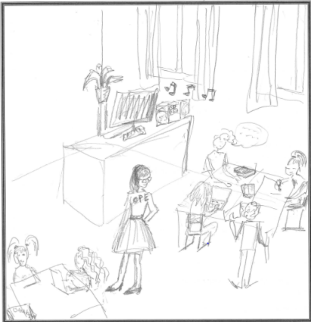
Figure 2. The teacher standing in the middle of a modern classroom, pupils interacting among themselves at desks in different constellations (originally in black-and-white). Translation: ope 'teacher'.