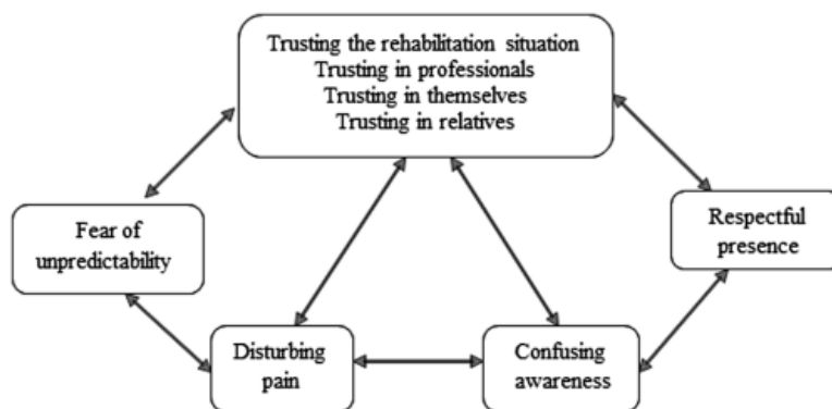
Figure 2. The structure of "meaning perspective of goal setting."

In this study, the goal attainment scale method was used in goal setting and each rehabilitee set one goal with the multidisciplinary team for the six-month rehabilitation period [4]. The meanings of the participation in the goal setting situation experienced by the rehabilitee were as follows: "trusting the rehabilitation situation" linked with the meanings "trusting professionals, oneself, and relatives," "respectful presence," "confusing awareness," "disturbing pain," and "fear of unpredictability." The most significant meaning "trusting the rehabilitation situation" included the meanings "trusting professionals" and "trusting oneself," and "trusting relatives" as seen in Figure 2. Above is the perspective from which the goal setting meaning perspective opens up and should be read (Figure 2). All meanings were connected to each other, forming interconnected triangles. The most valuable meaning "respectful presence" on the right proved to be the most significant of the rehabilitee's meaning units. The value of meanings was determined from each rehabilitee's individual meaning units and the synthesis of all rehabilitees meaning perspectives.