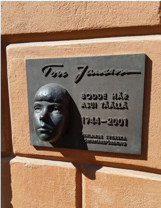
Figure 4. Tove Jansson’s memorial plaque (by Viktor Jansson).

In the course of this non-chronological walk, places encountered are connected to “different stages of Jansson’s life: here she’s a teenager, posing for her father’s statue; here she goes to art school that she disliked; here is her as an adult walking through the city” (December 2017). Because not even twenty years have passed since her death, many places likely stayed the same as they were in her later years. However, many sites included in the walk are connected to an earlier time in her life – first as a child, then as a student and young adult, and later as a known artist and writer.