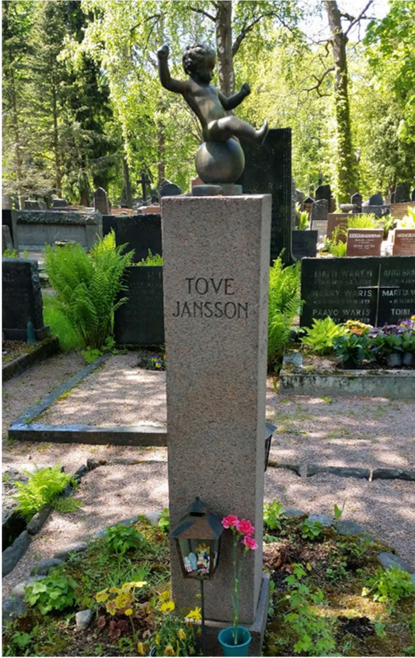
Figure 3. Tove Jansson's grave, Hietaniemi cemetery. Photo by author, 2017.

While no augmented reality software was used during the walk to enhance the urban space (Sandvik and Waade 2008), personal mobile devices were used for consulting the itineraries, navigating, and fact-checking. Because it is not a guided tour, visitors (like my colleague and myself) act as their own guides, so much depends on one's ability to find the required information and to utilise it during the tour. Instant access to biographical information via mobile devices enabled our independent navigation through the city and allowed us to correlate the places visited with specific events in Jansson's life.