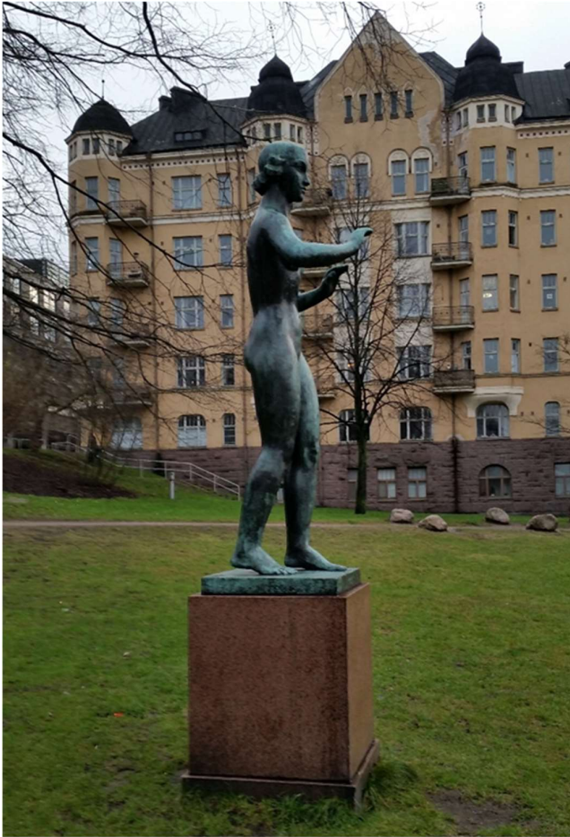
Figure 2. Convolvulus by Viktor Jansson (modelled after teenage Tove Jansson). Photo by author, 2017.

In their analysis of crime scenes as mediatised spaces, Sandvik and Waade (2008) observe that spatial augmentation – the enhancement of space through senses and emotions on the basis of media connections and through the use of media – can occur, among other means, by narrativization and fictionalisation. During our walk, it is the narrative of Jansson’s life that gets told and laid out across the city, as is reflected in the title of the Helsinki Art Museum’s itinerary, “The life path of Tove”.