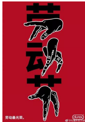
Figure 6. Durex’s advertisement during the Labor Day

The fourth advertisement is published on the first of May 2017.