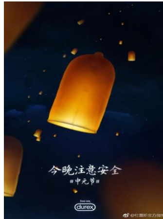
Figure 4. Durex’s advertisement during the Ghost Festival

The first picture was posted on January 27 th 2017, which is Chinese New Year’s Eve. The post has had 10553 reposts, 2540 comments, 3613 likes on Sina Weibo. Durex published this advertisement with along text: “So wish you best luck in the year of the rooster.” According to the Chinese 12-year animal zodiac cycle, the Chinese year beginning in 2017 is the year of the Rooster. That’s the reason why this advertisement has a strong link with the rooster.