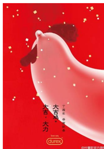
Figure 3. Durex's advertisement during the Chinese New Year