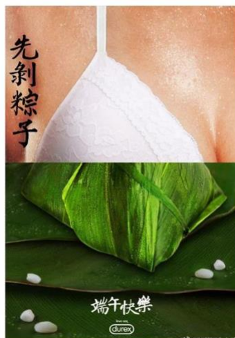
Figure 7. Durex’s advertisement during the Dragon Boat Festival