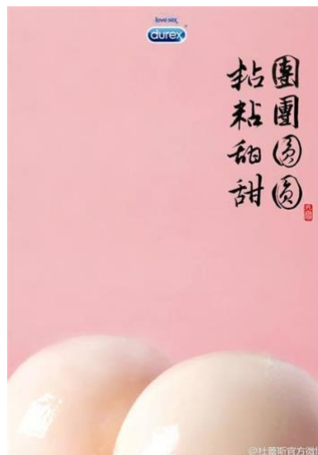
Figure 5. Durex's advertisement during the Lantern Festival

The third advertisement was published during the Chinese Lantern Festival. The background uses light pink color. In the bottom of the advertisement, there are two white Chinese dumplings-glutinous rice balls, which is the typical food for this festival. The placement of the rice balls also