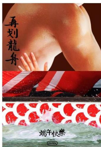
Figure 8. Durex’s advertisement during the Dragon Boat Festival

The last advertisement was published on 30 th May 2017. On that day is another traditional Chinese festival – the Dragon Boat Festival. Durex published two advertisements in one post to send greetings. Each picture is