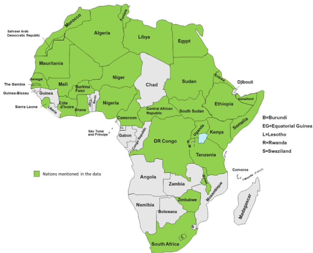
Figure 2 Regional coverage of the Guardian news on the map

North Africa is well-reported in the Guardian news, as all the North-African Arab League countries are mentioned as the primary nation at least once in the data. Furthermore, there are over 15 articles of Libya and Egypt. Indeed, Libya is among the most reported countries, which is likely to be explained with the cooperation between Libya and several European countries concerning the problematic migration situation in the Mediterranean. Furthermore, most news articles about Libya discuss the refugee crisis and the horrific conditions in the Mediterranean: Italy's deal with Libya to 'pull back' migrants faces legal challenge (G080518-1), UN accuses Libyan linked to EU-funded coastguard of people trafficking (G080618-2), Libya rejects EU plan for refugee and migrant centres (G200718-4), Deaths at sea expose flaws of Italy-Libya migration pact (G230718). Another important theme in the Libyan news reportage is the torture case of Abdel Hakim Belhaj between Libya and the UK: Settlement in Abdel Hakim Belhaj rendition case to be announced (G090518-2), Britain apologises for 'appalling treatment' of Abdel Hakim Belhaj (G100518-1), Tony Blair refuses to apologise to Libyan torture victim Abdel Hakim Belhaj (G220518-3).