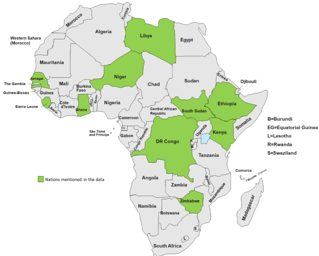
Figure 4 Regional coverage of the Helsingin Sanomat news on the map

The Democratic Republic of Congo is the most prevalent African country in HS news. As noted before, DRC is also one of the most-reported countries in the Guardian. Similarly to the Guardian's data, the articles in HS focus on the Ebola epidemic and the case of Jean-Pierre Bemba and his sentence on war crimes: The international criminal court overturned the Congolese war lord's sentence for war crimes (HS080618-1).