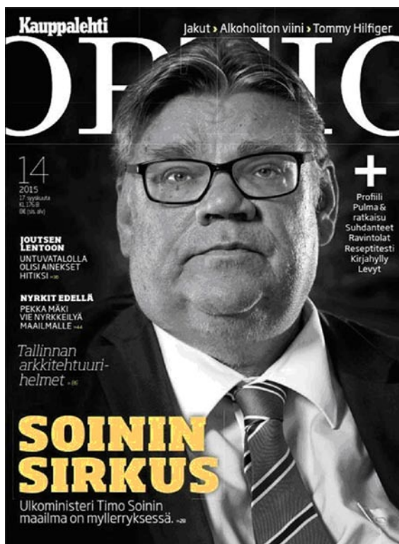
Picture 4. Cover picture of Kauppalehti monthly

Much of the success of the Finns Party boils down to an identity politics where traditional gender roles and family values are in a