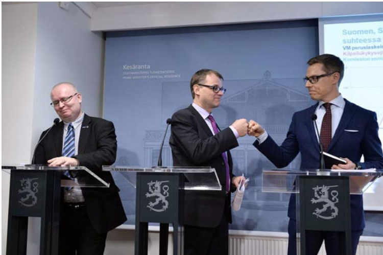
Picture 7. ‘We made it!’ Ministers’ boyish fist bump to celebrate the agreement between different sides of the labour market.

It is evidence of the new political status of the Finns Party that it has managed to create new normalities to the political language and other practices. One example of the latter: representatives of the other two parties in the present cabinet – The Coalition party and the Centre party – have started showing signs of enhanced masculinity as well. The most famous of these was the ‘fist bump’ of representatives of the three parties – Jari Lindström (Minister of Justice and Minister of Labour), Juha Sipilä (Prime Minister), and Alexander Stubb (Minister of Finance) – in early March 2016, in connection with a success in pressing forward the ‘competitiveness boost’ with the help of a ‘historical’ (forced) agreement between different sides of the labour market. It is possible to interpret the gesture as another sign of the spread of a new, ‘boyish’ populist style in Finnish top politics. The gesture was (not without justification) interpreted in Finland as a sign of a backlash, although in another context it could be seen as a mark for a new, relaxed political culture (see for