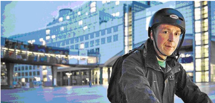
Picture 6. Jussi Halla-aho, MEP, leader of Finns Party since June 2017

In contrast to Soini, Halme and Vistbacka, the public image of Jussi Halla-aho, leading figure of the anti-immigration fraction of the party, is a far cry from any bloke-like appearance. Although a populist politician in the strong sense of the term, he acts and looks like an academic. It would be hard to imagine him calling himself a 'jätkä' – or being called one. Rather, with the bike, helmet, and backpack, and overall learned habitus, he would easily go for a supporter of the Green Party. Halla-aho's political agenda is actually very narrow and boils down to just three topics: immigration