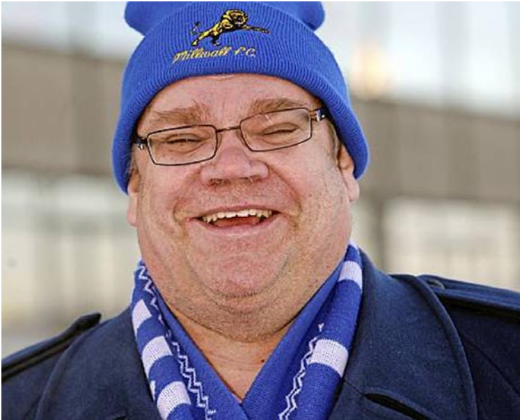
Picture 3. Blokeness of Timo Soini

high position as Minister. Besides the language, also the use of pictures for self expression is important to note as part of Soini's political image. At the same time, photographers and journalists are lured to take seriously the casual style of the populist leader. It is somewhat banal that the nasal hair of Soini became a kind of trademark of his relaxed masculinist politics (see the cover of the leading Finnish business journal Kauppalehti's monthly review on the next page). Within Soini's habitus hairiness could also be seen as a sign of experience (age) and of a hard working masculine guy with no time to take care of outer appearance. In official and public pictures these kinds of details are not there just by accident.