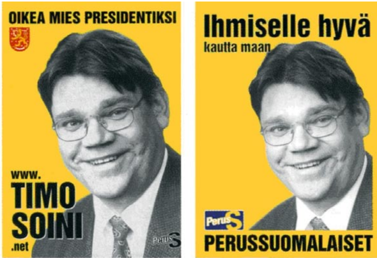
Picture 2. Posters used in presidential (2006) and parliamentary (2007) elections

somewhat plump, but honest, sympathetic, critical of the ‘real’ politicians and the consensus politics of his time. The following two pictures from Soini’s campaign ad are republished in Soini’s first book (2008). The caption shows a degree of self-irony: ‘The invitation to dance by a district agrologist’ -look worked well both for presidential and parliamentary elections.