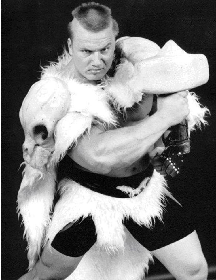
Picture 1. Tony Halme, show wrestler and later MP of Finns Party

The male swing voters and non-voters would later on be even more important for the slowly rising success of the party in the 2007 parliamentary elections (5 MPs) and particularly in the 2011