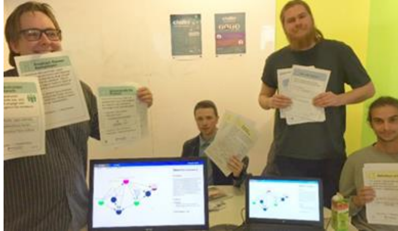
Fig. 2. A project team showing their practice cards