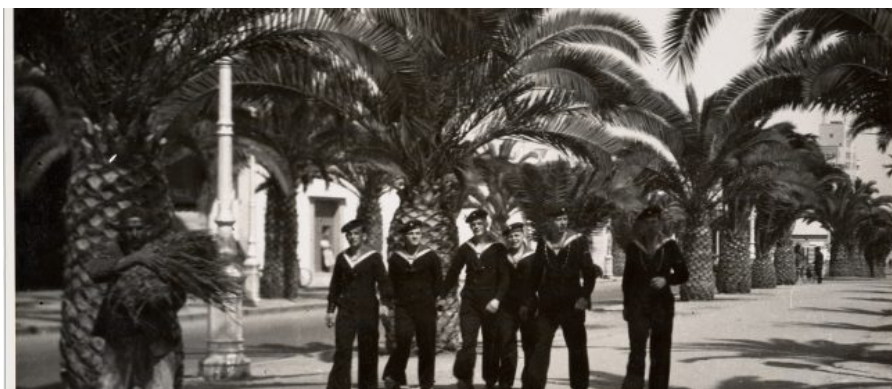
Finnish seamen from Suomen Joutsen, a school ship for Finnish Navy, in Lissabon 21.-22.4.1934.