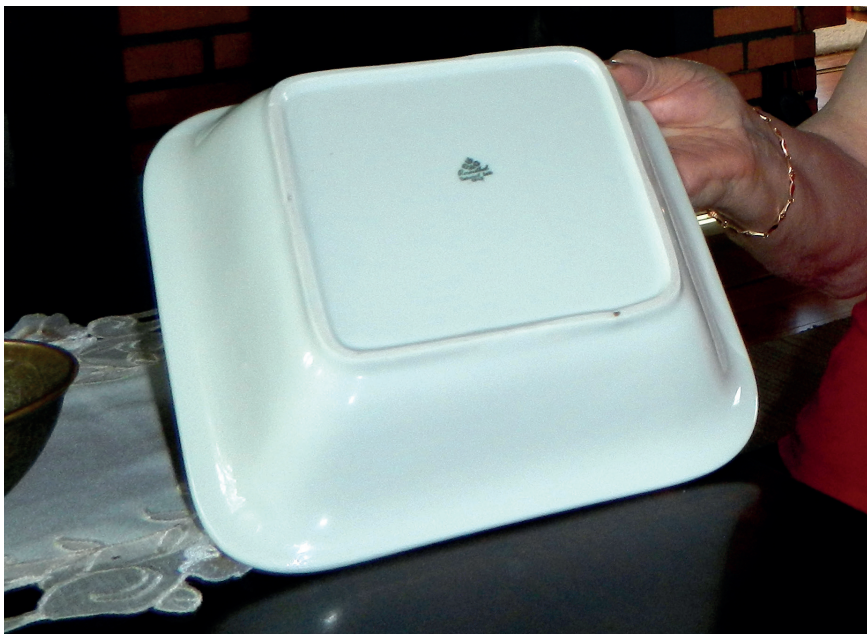
Figure 2: A German honey bowl given to the family of the interviewee (Interview 3) during the war.

about Germans and the Ingrian prisoners. Our interviewee began to explain that the Germans were generally very friendly and polite towards the locals. The interviewer's family also developed a warm relationship with one particular Ingrian prisoner and were shocked to witness a scene where the PoW's wife was deported to another camp and the couple had to say goodbye, very likely for the last time. The interviewee also mentioned a contradictory feeling that the bowl evoked for her. For a long time, she felt that she had had enough of honey and never ate any for the rest of her life. This affectionate, and in many ways contradictory, history described how a gift – or more accurately, an artefact of exchange – became a cherished memento of complex and ambivalent transnational war history.