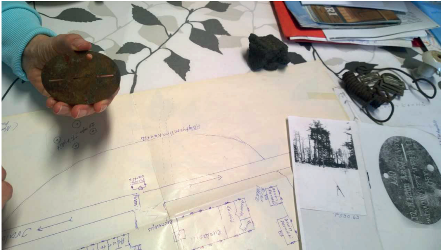
Figure 4. Treasures found from German settlement in Vuotso shown to us by the interviewee.

For those who come from outside of the community, the closeness of the war remnants may be exotic and intriguing. Interestingly enough, when it comes to war history, the most active person in the community, at least with regards to our study, is a retired lady who was born and spent her childhood in Rovaniemi but lived most of her life in Southern Finland. She moved to the Vuotso area in a cottage as a result of ‘downshifting before the concept was invented’ (Interview 1) about 15 years ago. This person, who we have identified as a local heritage activist and history expert, invited us to Vuotso and organized most of the interviews that we conducted. Although not born in the village and thus not a native or family member, she is known even among the schoolchildren as a history expert, and has gained the elders’ trust in her attempts to document and safeguard the local war heritage. Even though she is critical of treasure-hunting by random visitors, she herself has a small collection of objects that she has found from the German settlements, which she showed to us during the interview. She told us that she has only taken small objects that are numerous and has left larger or rarer objects in situ. Among the most interesting objects she has found (Figure 4) is an unused identification plate which she has shown to some villagers who doubt its authenticity, and a compact which she thinks is ‘a real treasure’.