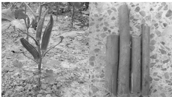
Figure 1: Okra plant (left, a) and dried stalks (right, b)

Total acid hydrolysis. The content of different monosaccharides ( i.e. , arabinose, galactose, glucose, mannose and xylose) in the Klason hydrolysates (TAPPI Test Methods T222 om-98, T249 cm-00 and T250) from the extractives-free okra samples was determined by using a Dionex high performance liquid chromatography-pulse amperometric detection (HPLC-PAD) equipped with an AS50 autosampler, a LC25 chromatography oven, a GS50 gradient pump, a CarboPac PA-1 column and an ED50 detector with carbohydrate pulsing. 21 Samples were eluted with ultra-high-quality (UHQ) water— internal resistance \leq 18.2 \text{ M}\Omega\text{cm} at 25 °C – with NaOH gradient at a flow rate of 0.3 mL/min. The UHQ water used for the preparation of the mobile phase was degassed via ultrasonic treatment for approximately 15 min prior to use. Post-column alkali (300 mMNaOH) addition was performed at a flow rate of 0.1 mL/min with an IC25 isocratic pump to enhance the performance of PAD. Data were stored and processed using the Dionex Chromeleon (6.50) data system. The peak identification and the mass-based response factors between an internal standard (L-fucose) and each monosaccharide were based on separate runs with model monosaccharides.