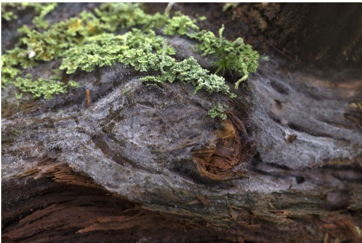
Figure 26 – Tulasnella brinkmannii s.l. in Suomussalmi (TH 20170002).