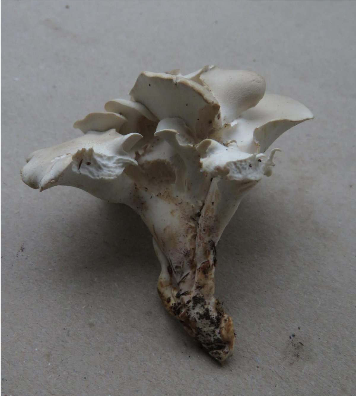
Figure 13 – Osteina obducta in Parainen, ex situ.

New to Finland, and hence new to 1b. The species is also new to Northern Europe.