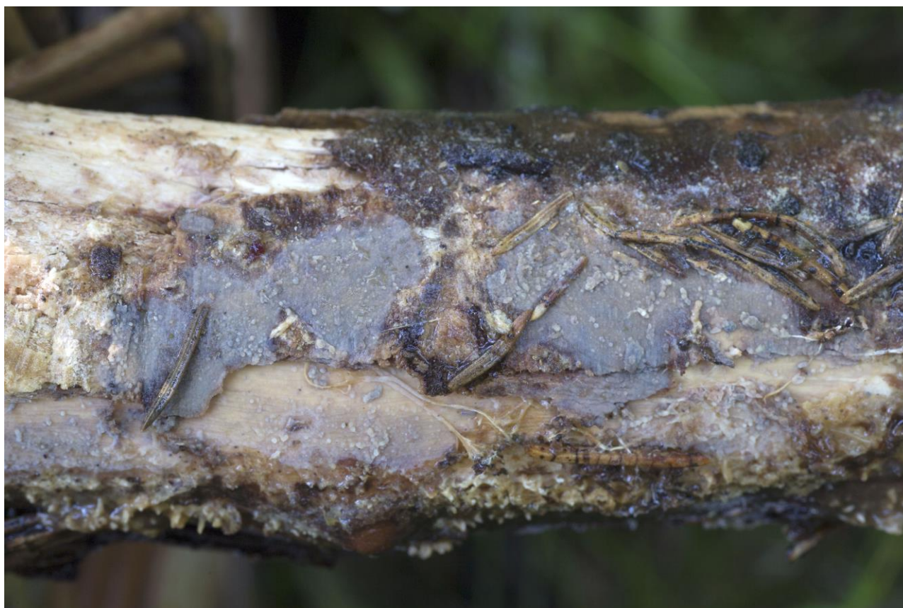
Figure 14 – Phanerochaete deflectens in Kajaani (TH 20170035).

New to Southern boreal, Lake District (2b) and Middle boreal, Northern Carelia – Kainuu (3b). Near Threatened.