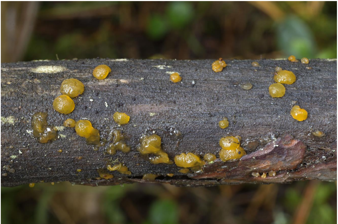
Figure 9 – Dacrymyces ovisporus in Kajaani (TH 20170033).

New to Middle boreal, Northern Carelia – Kainuu (3b). There are several collections from Kajaani area after this by the author TH.