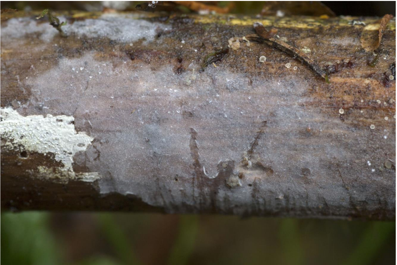
Figure 27 – Tulasnella deliquescens in Puolanka (TH 20170040).