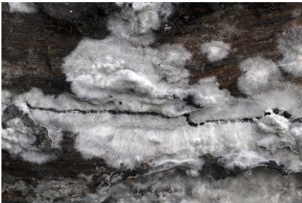
Figure 18 – Sistotrema autumnale in Puolanka.

These are the 7 th –18 th record in Finland. The previous ones are from Helsinki (1b), Lammi (2a), Padasjoki (2a), Kesälahti (2b), Suomussalmi (3b), and Rovaniemi (3c) (Kotiranta et al. 2009, Kunttu et al. 2011).