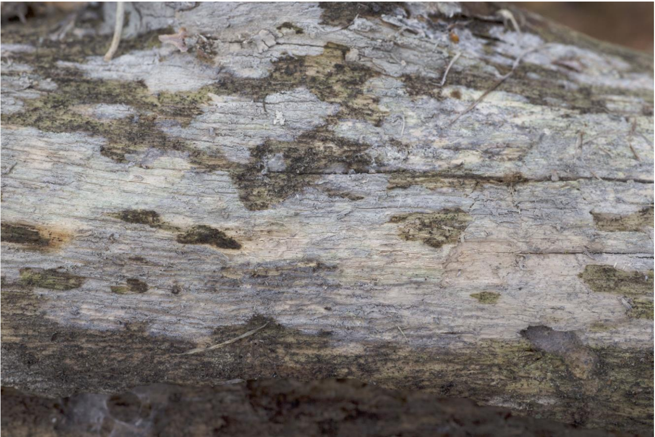
Figure 30 – Xenasmatella borealis in Kajaani.