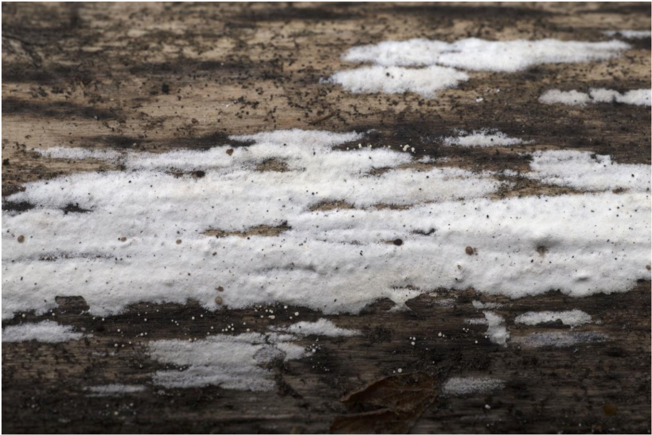
Figure 10 – Helicogloea farinacea in Paltamo (TH 20160104).

New to Middle boreal, Northern Carelia – Kainuu (3b). These are the 5 th –6 th records in Finland. The previous records are from Karjalohja (1b), Helsinki (1b), Lempäälä (2a), Tampere (2a) (Kotiranta et al. 2009, Kunttu et al. 2013).