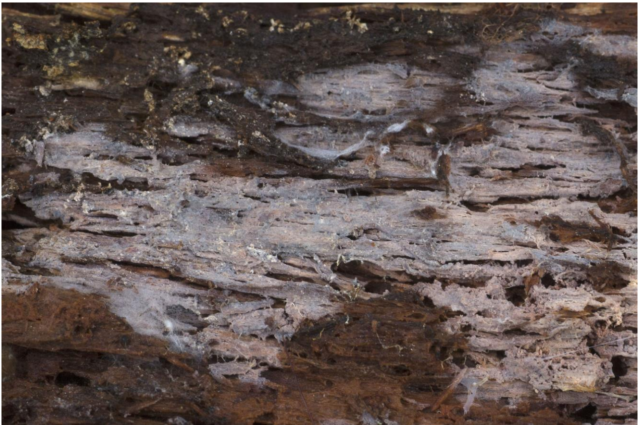
Figure 5 – Basidioidendron radians in Paltamo.

New to Middle boreal, Ostrobothnia (3a). This is the 4 th record in Finland. Previous records are from Lohja (1b), Kirkkonummi (1b) and Padasjoki (2a) (Kotiranta et al. 2009).