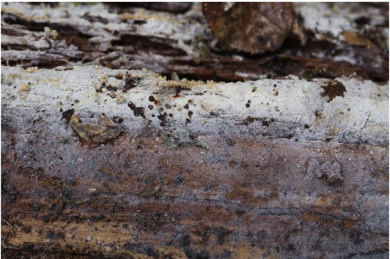
Figure 6 – Botrybasidium elliposporum in Puolanka (TH 20170001).

New to Middle boreal, Northern Carelia – Kainuu (3b). This is the 2 nd record in Finland. The previous record is from Lammi (2a) (Kotiranta et al. 2009). The specimen was an anamorph like the first Finnish collection.