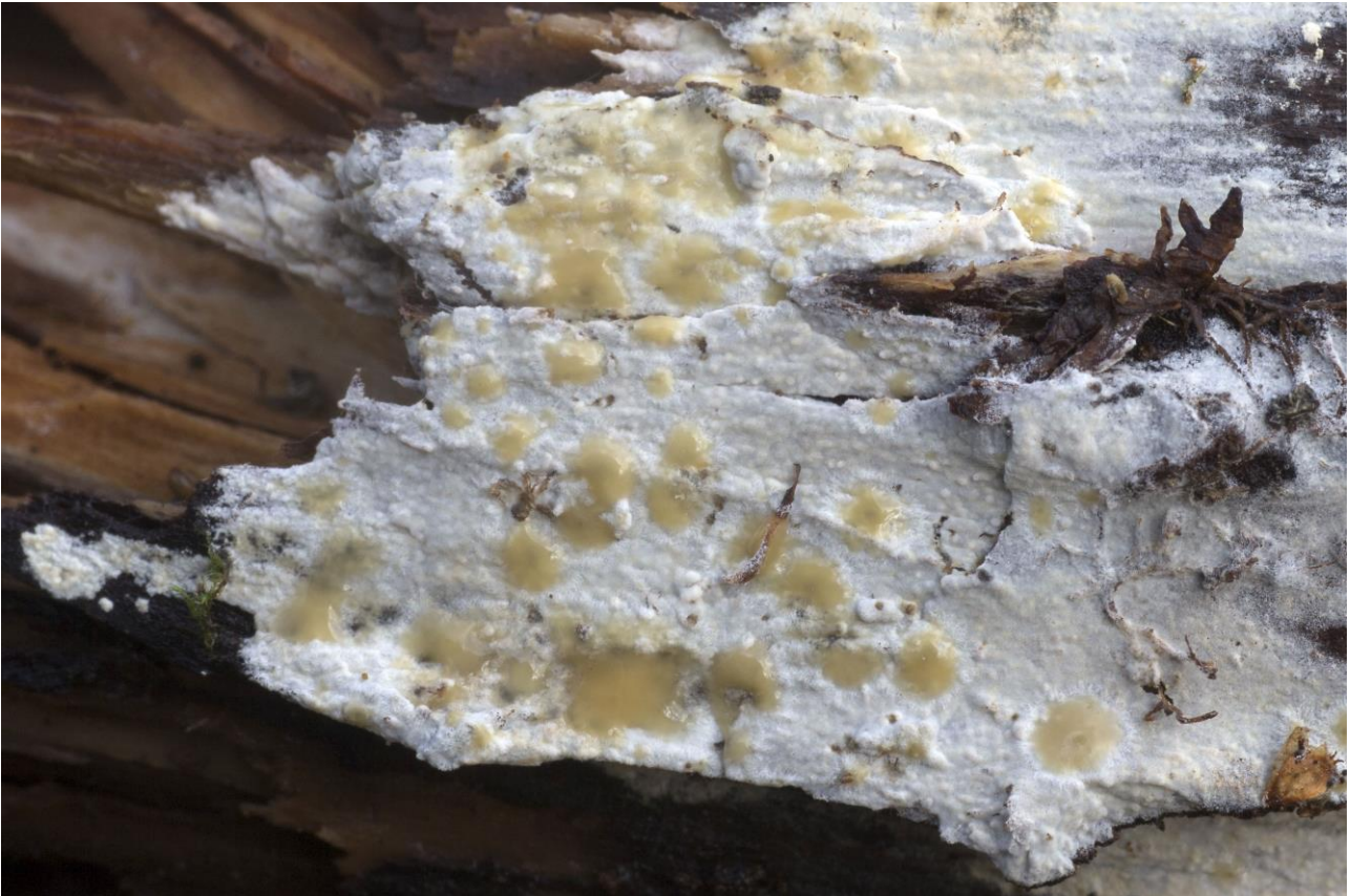
Figure 7 – Colacogloea peniophorae grew on Peniophorella pratermissa in Kajaani (TH 20170006).

These are the 3 rd –4 th records in Finland. The previous ones are from Lammi (2a) and Muurame (2b) (Kotiranta et al. 2009).