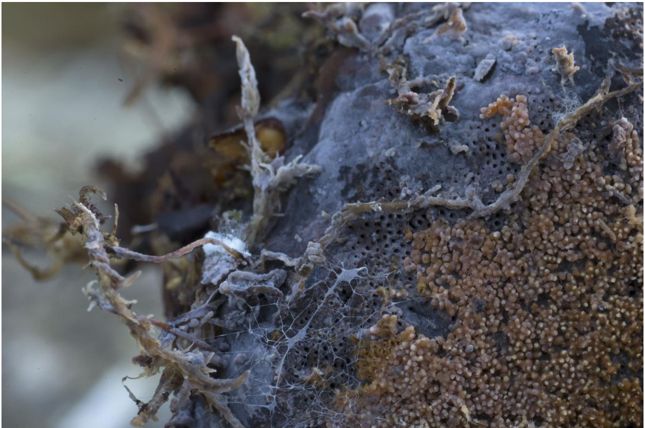
Figure 24 – Tulasnella albida in Kajaani.

New to Finland, and hence new to Southern boreal, lake district (2b) and Middle boreal, Northern Carelia – Kainuu (3b).