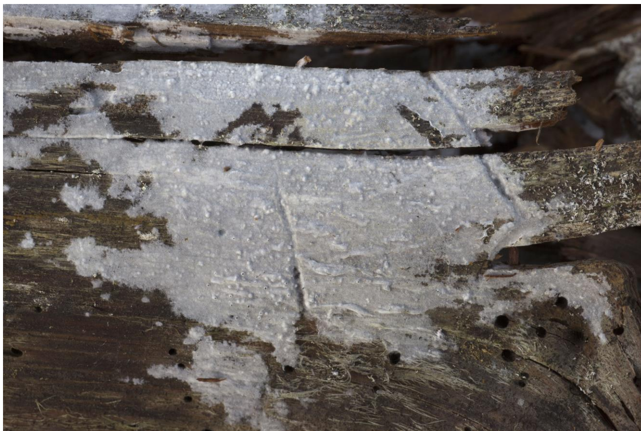
Figure 4 – Athelia singularis in Suomussalmi.