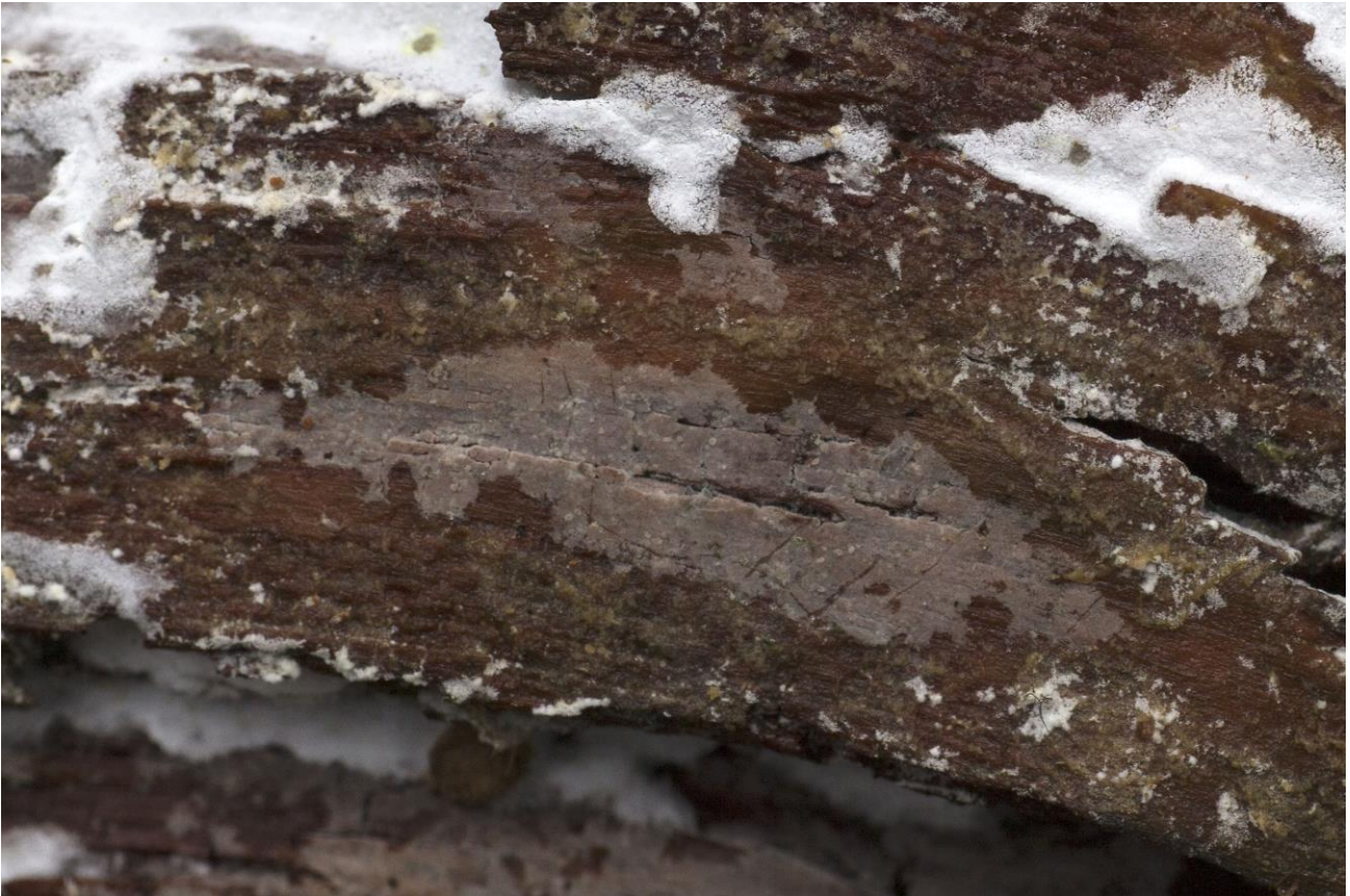
Figure 20 – Suillosporium cystidiatum in Puolanka (TH 20170004) with Tylosporium fibrillosum .

det. HK. This latter record has previously reported from false subzone (3b) (Kunttu et al. 2016a), but it should be 4a.