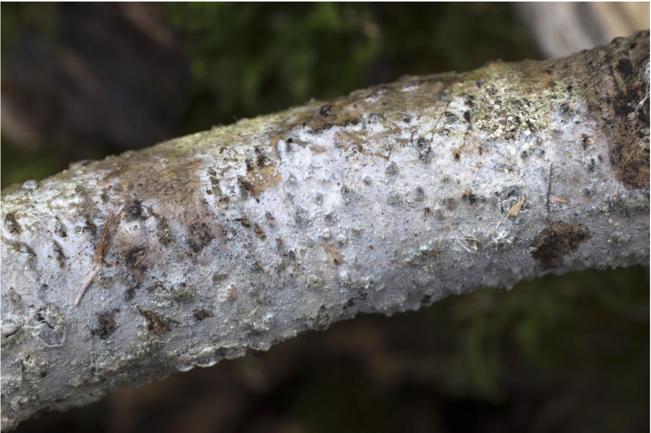
Figure 31 – Xenasmatella insperata in Kajaani (TH 20170034).