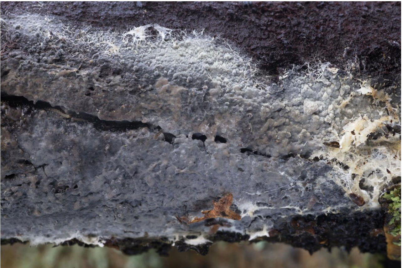
Figure 29 – Xenasma pruinatum in Kajaani.