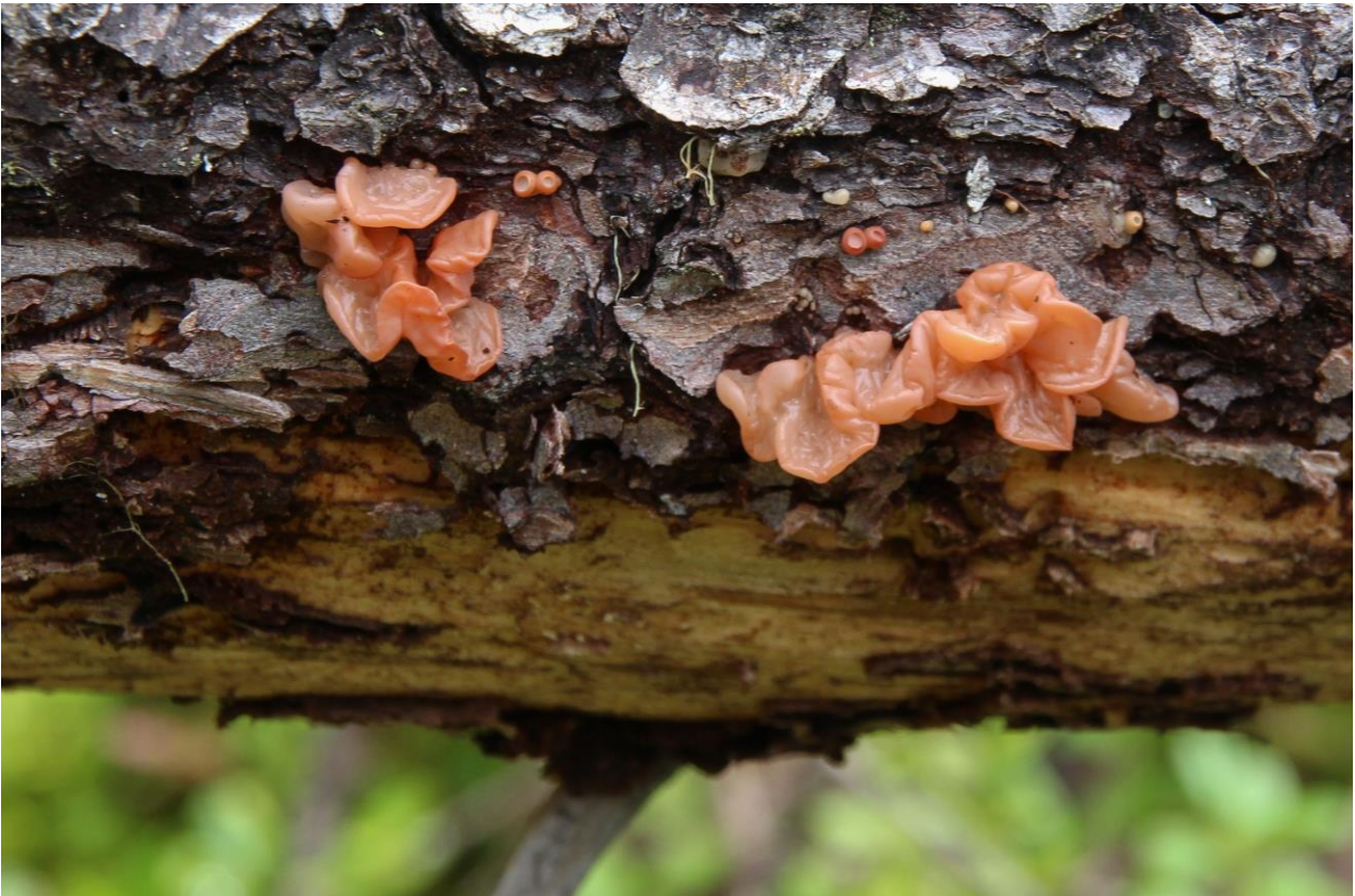
Figure 8 – Craterocolla cerasi in Kolari (TK 2314).