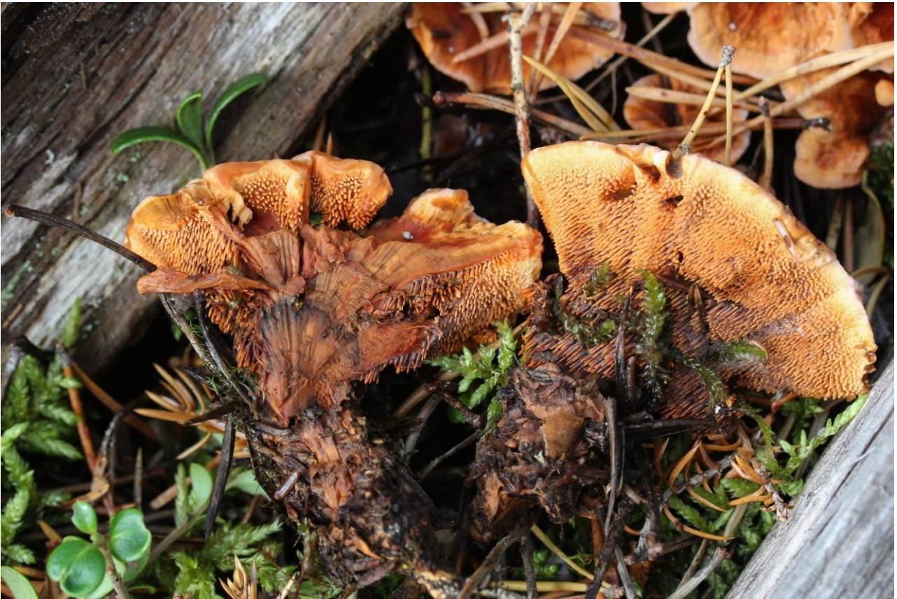
Figure 11 – Hydnellum auratile in Pelkosenniemi (TK 2452).