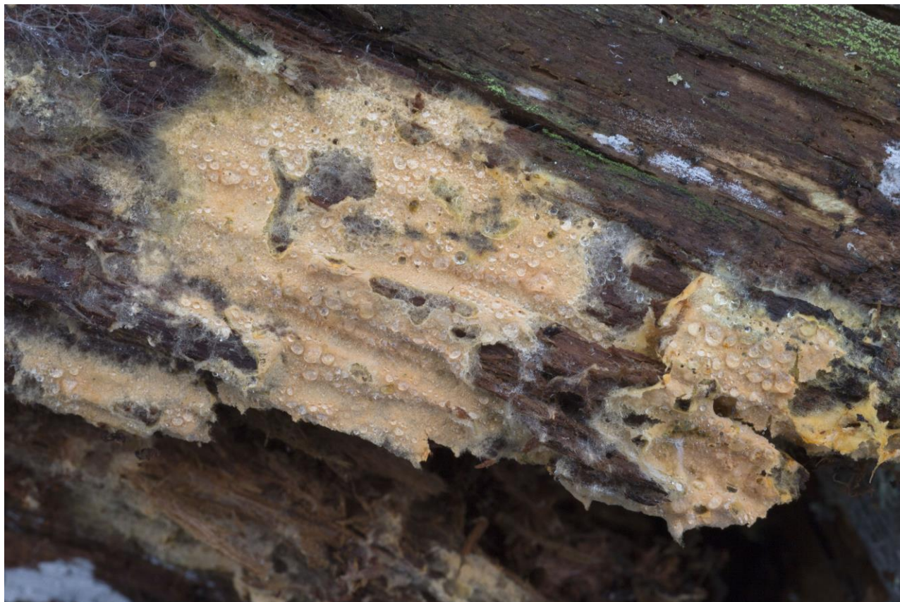
Figure 23 – Tretomyces microsporus in Suomussalmi.

Northern boreal, Kuusamo district (4a). These are the 3 rd –4 th records in Finland. The previous records are from Paltamo (3a) and Lieksa (3b) (Kotiranta et al. 2009, Kunttu et al. 2015).