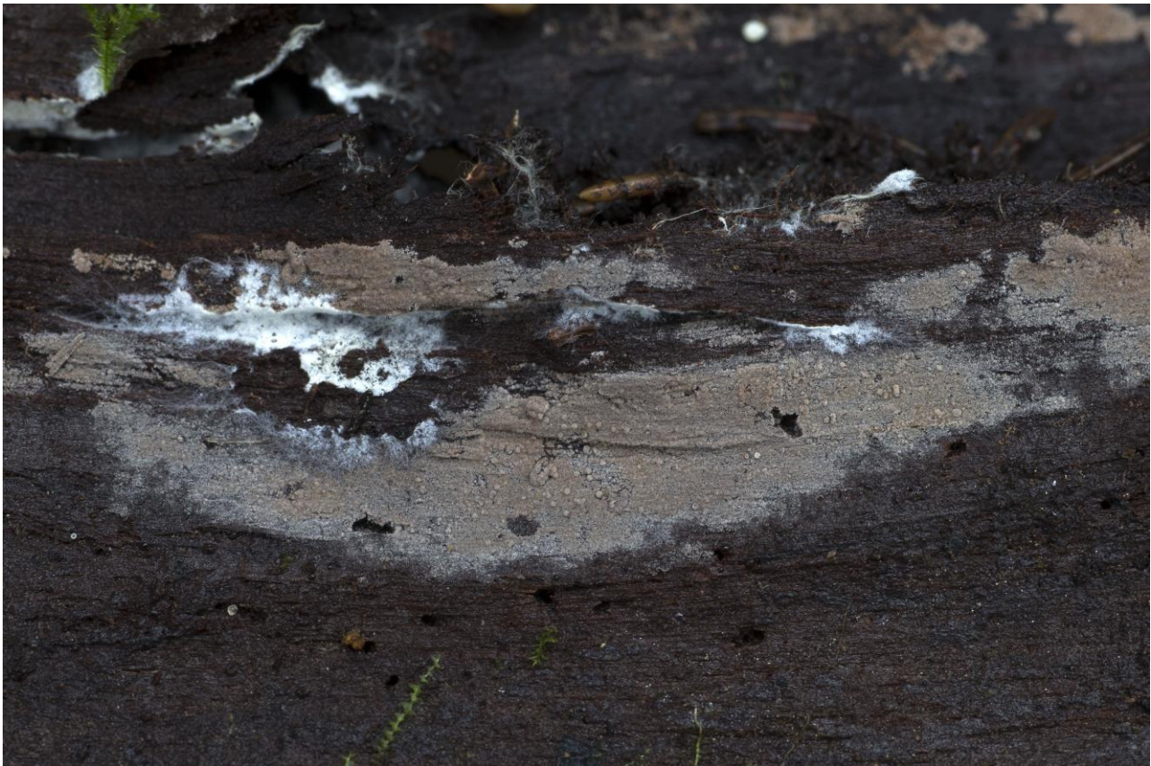
Figure 22 – Tomentella subclavigera in Sotkamo (TH 20170011).

New to Southern boreal, Lake District (2b) and Middle boreal, Northern Carelia – Kainuu (3b).