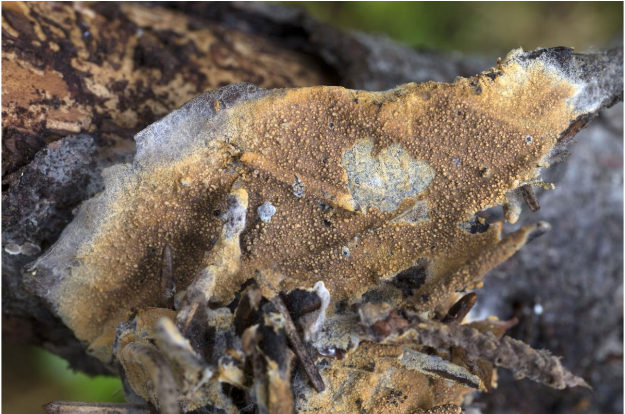
Figure 21 – Tomentella coerulea in Kajaani (TH 20170010).

New to Middle boreal, Northern Carelia – Kainuu (3b). This is the 7 th record in Finland. The previous records are from Parainen (1b), Kemiönsaari (two sites, 1b), Rautalampi (2b), Rovaniemi (3c), and Enontekiö (4c) (Kotiranta et al. 2009, Kunttu et al. 2012, 2013, 2014)