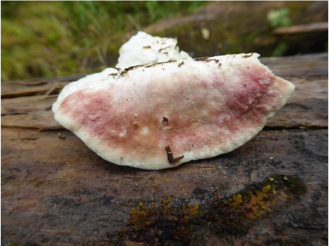
Figure 17 – Postia persicina in Kuusamo.

This is the 3 rd record in Finland. The previous ones are from Jämsä (2b) and Kuusamo (4a) (Kotiranta et al. 2009). Vulnerable.