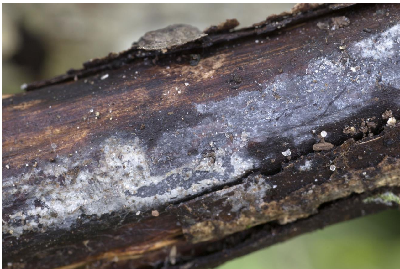
Figure 2 – Amyloenasma allantosporum in Suomussalmi (TH 20170037).

These are the 7 th –9 th records in Finland. The previous records are from Tammisaari (1b), Helsinki (1b, two sites), Kuhmoinen (2b), Toivakka (2b) and Lieksa (3b) (Kotiranta et al. 2009, Miettinen 2012).