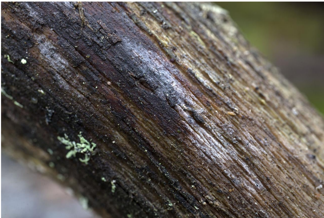
Figure 25 – Tulasnella allantospora in Suomussalmi (TH 20170015).

New to Southern boreal, Lake District (2b) and Middle boreal, Southwestern Lapland (3c).