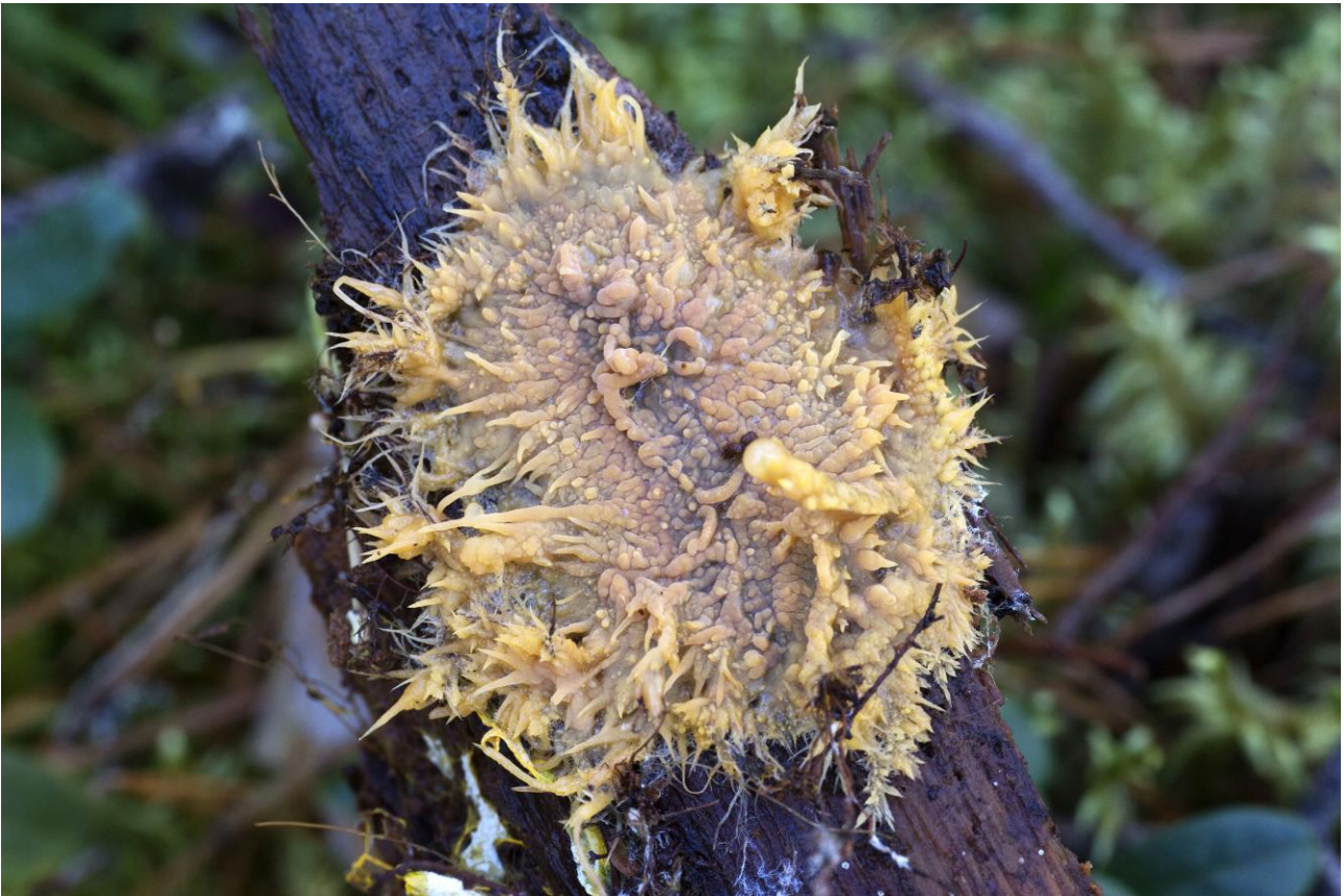
Figure 15 – Phlebia femsioeensis in Kajaani (TH 20160105).