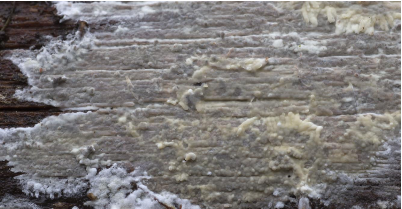
Figure 16 – Phlebia subcretacea in Suomussalmi.