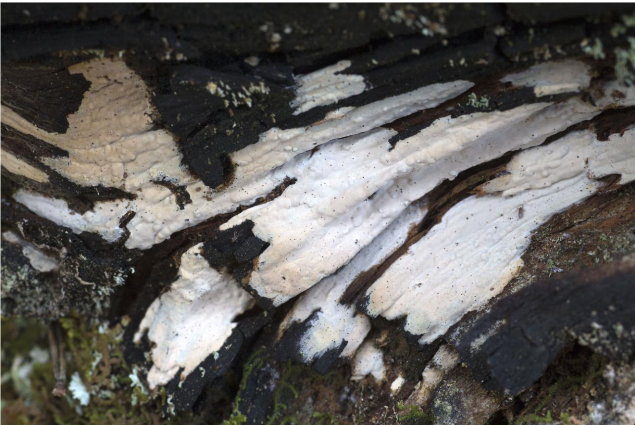
Figure 12 – Hyphoderma crassescens in Paltamo.