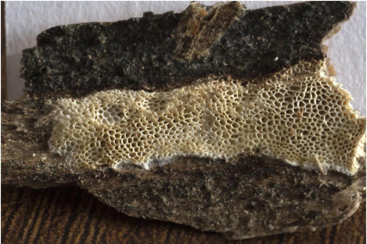
Figure 3 – Antrodiella mappa in Sotkamo, ex situ.

New to Middle boreal, Northern Carelia – Kainuu (3b). This is the 6 th record in Finland. The previous records are from Nauvo (1b), Korpilahti (2b) and Savonranta (2b), Puolanka (3a) and Kankaanpää (3a) (Kotiranta et al. 2009, Kunttu et al. 2011). Endangered.