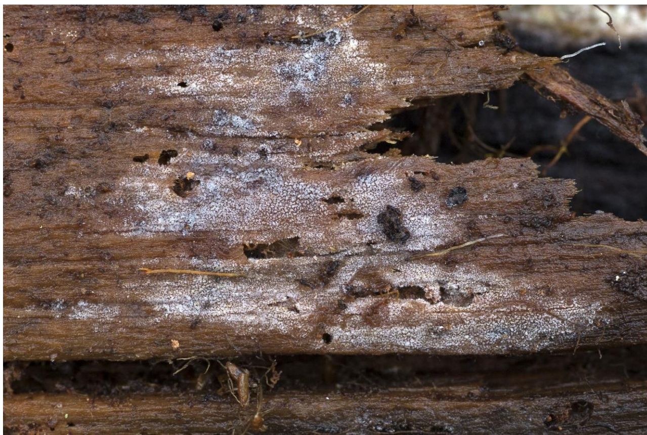
Figure 19 – Stypella vermiformis in Suomussalmi (TH 20170014).

This is the 5 th record in Finland. The previous records are from Kemiönsaari (1b), Lieksa (two sites, 3b), and Inari (4c) (Kotiranta et al. 2009, Kunttu et al. 2016a).