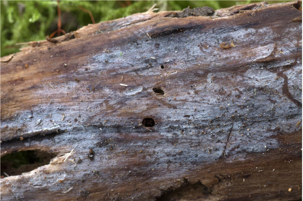
Figure 28 – Tulasnella tomaculum in Kajaani.