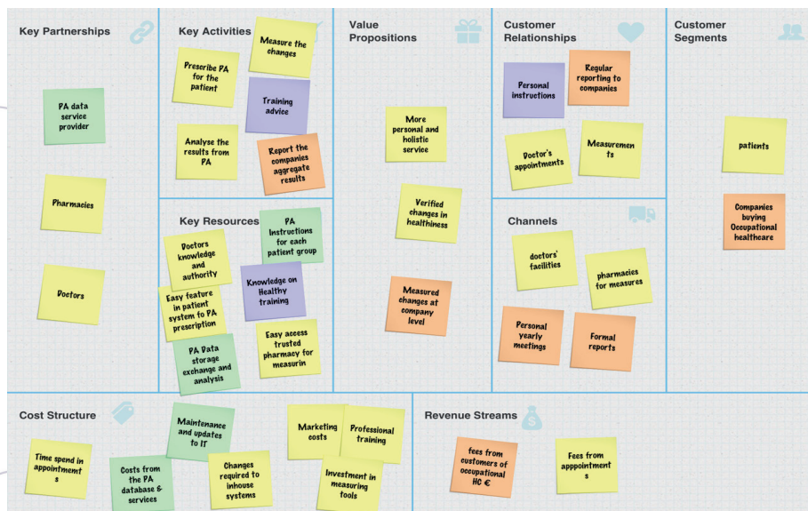
Figure 2: Business Model of the empirical case

The next step was to define the metrics related to the eight perspectives of the framework proposed earlier. Based on the research data, the researchers proposed to the practitioners the objectives or critical factors that should be measured from each perspective. For instance, customer retention was one of the main concerns of the companies, which has led them to include 'drop out rate' as one of the service-driven metrics. In addition, the companies involved suggested other issues, such as user experience, process quality and willingness to share knowledge, to be subjected to measurement. Collaboratively, the authors and the entrepreneur constructed a set of performance metrics for all these issues. For instance a modified servqual metrics (Parasuraman et al., 1988) was selected to measure user experience, and the number of errors/reclamations and time spent in handling reclamations provides a measure of process quality. The indicators are presented in Table 3.