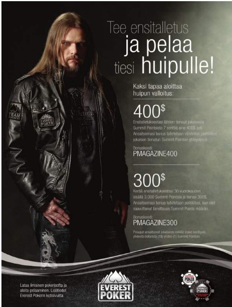
Image 1. Heavy rock and online poker (PMF, 3/2009, 85; see also 3/2009, 4-5 for another heavy rock musician endorsing poker.)

which does matter as it is the most commonly used symbol of poker and the measure of a player's skills. The way the character is composed implies that poker is a competition for no-nonsense, tough men (van Ingen 2010, Jouhki 2010, 65).