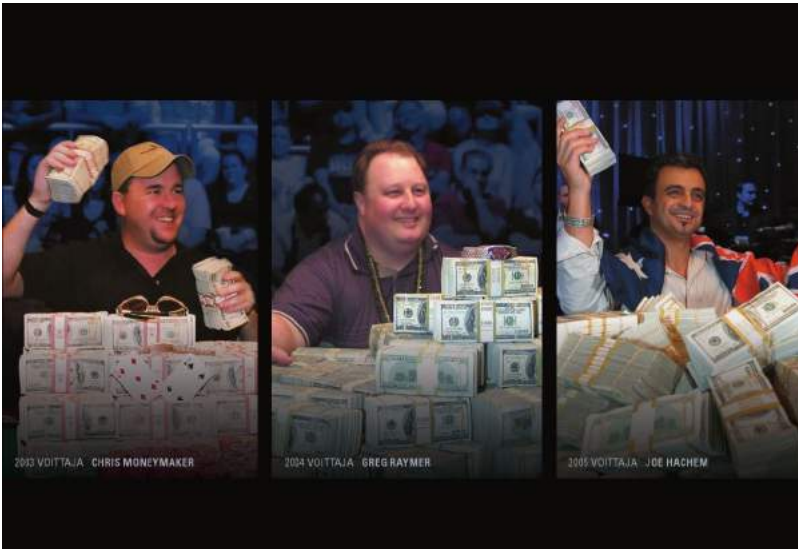
Image 7. PokerStars ad has winners smiling (PMF, 3/2009, 19, partial image of an ad; for more ads portraying victory and joy see 3/2009, 11-12; 4/2009, 2-3).

There was no smiling man portrayed playing poker in any of the ads in PMF in 2009. Women players were portrayed smiling, however; they were either luring potential players into a game room or playing strip poker almost naked (see lower left-hand corner of Image 8). The latter was depicted in an image that was a part of a Ladbrokes ad and included four images framed like poker cards on a red background. Three of the pictures showed people with smile on their faces, while the fourth showed nobody, just a boat on a beach. In one image (top left-hand corner) there were two smiling women wearing evening dresses and a serious man – not smiling because he was the player – wearing a suit and sunglasses. The man was holding a woman’s hand and was throwing