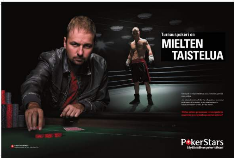
Image 3. Battle of minds (PMF, 1/2009, 4-5; for a similar slogan see 4/2009, 4-5; for another ad referring to poker as boxing, see 1/2009, 15).

In some ads, the elements of gravity and danger are created by making explicit references to fighting and battles. In an ad (Image 3) by PokerStars on a spread, the title states that ‘ tournament poker is a battle of minds ’ and ‘ a duel is an endurance battle where the last man standing will win. ’ The ad goes on to challenge the reader: ‘ If you love a battle, the biggest and the best tournaments are played at PokerStars. ’ The reverse page shows the Canadian poker professional Daniel Negreanu, a multiple world champion (see http://danielnegreanu.com ), staring solemnly in the camera, raising his bet at a poker table. Behind him there is a boxing ring with a boxer staring in the camera at least as solemnly as Negreanu. The manner in which the poker table and the boxing ring are positioned suggests a similarity between the two practices, both being games where (mostly) men engage in battle and where only one man emerges victorious. In real life, Negreanu or ‘KidPoker’, as he calls himself in online poker, is well known for his friendly appearance at poker tables, but to reflect the mood of online poker he has been turned into a fighter.