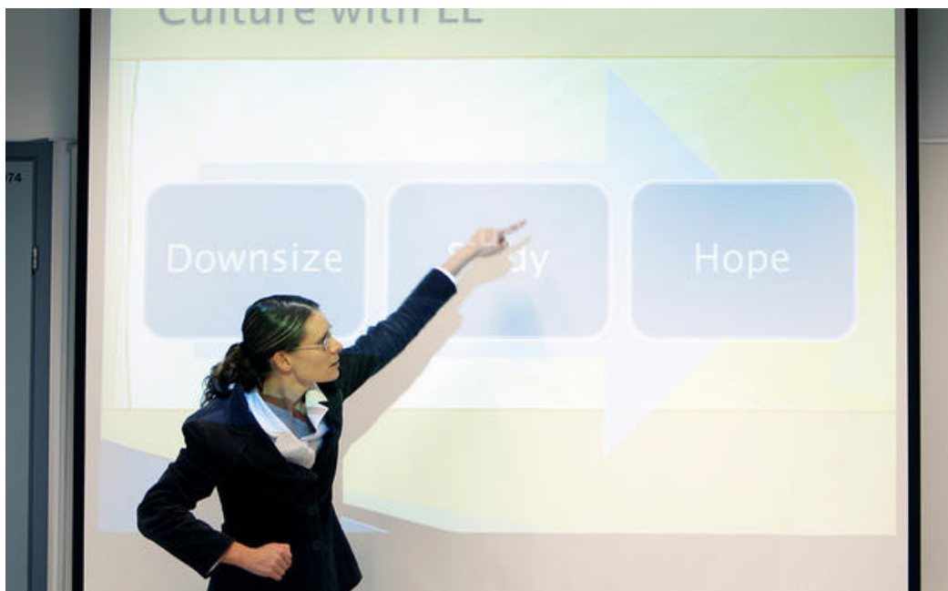
Figure 2. Longest Lecture Marathon, ANTI Festival Kuopio 2007 (image by Pekka Mäkinen, 2007, courtesy of ANTI Festival).

The Longest Lecture Marathon can be characterized as a techno-linguistic performance that is absurd and abstract, intimidating audiences and excluding people and things through language. The Longest Lecture Marathon was first performed at the ANTI Festival, in Kuopio, Finland (see Figure 2). In The Longest Lecture Marathon , 27 hr is spent reducing academic lecture material to a literal semiotic analysis of the foundations of words. The piece has been described as “Confusing, heavy, interesting, connected” (ANTI Contemporary Art Festival Kuopio, 2007). Later on, The Researcher (the name of both the project and the character), in her presentation of The Longest Lecture Marathon , has been likened to John Cleese “in Silly Lecturing at the University of Totally Trivial Pursuits” (Lathan, 2008).