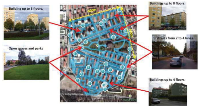
Fig. 1: GMDT field measurement area in Tampere, Finland

residential urban area in Tampere, Finland during September 2014 as shown in Fig. 1.