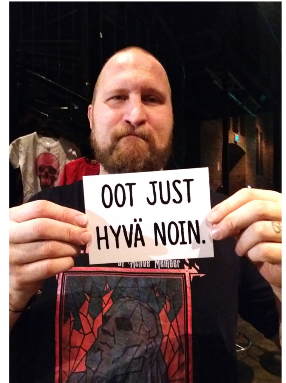
Finnish rapper Paleface with You're just fine like that. -card.