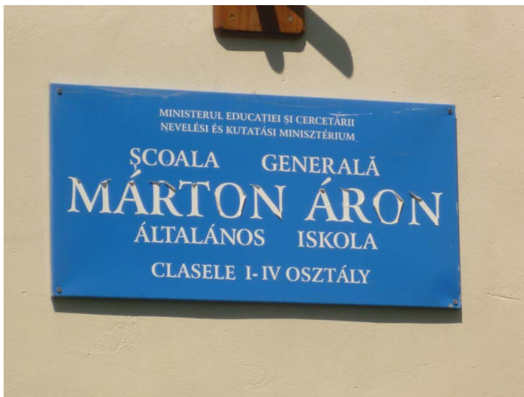
Figure 7. Official bilingual sign.