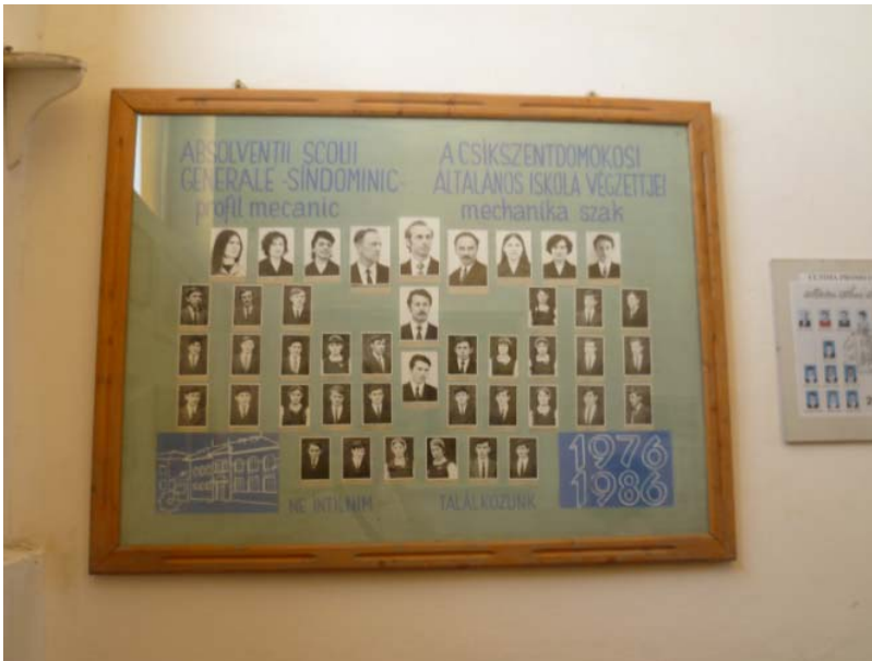
Figure 5. Bilingual graduation board of a vocational class from 1976.