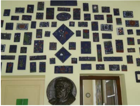
Figure 4. Children's artwork and a relief of Áron Márton.