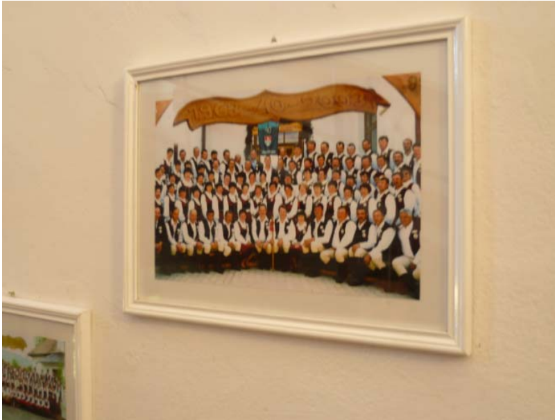
Figure 6. A class reunion in 2003.