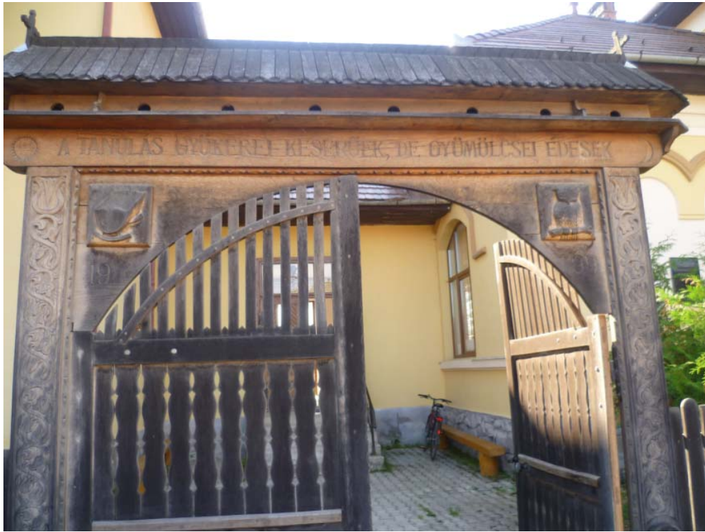
Figure 3. School gate with text in Hungarian above: ‘The roots of education are bitter, but the fruit is sweet’.