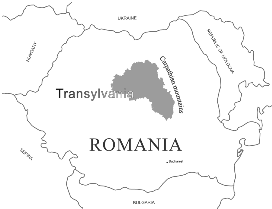
Figure 1. Area historically associated as Szeklerland.