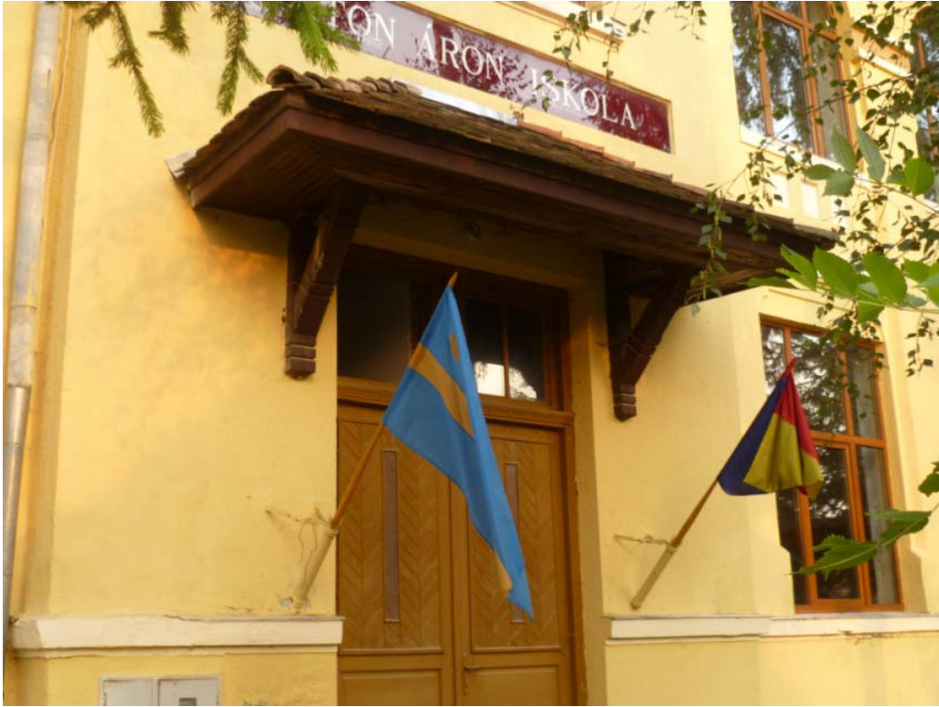
Figure 2. Szekler and Romanian flags, name of the school in Hungarian.