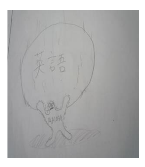
Figure 2. Large figures represent the sizable difficulties of English.