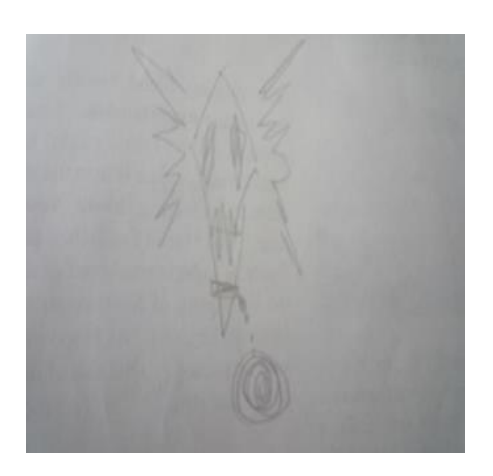
Figure 3. Angulated shapes represent a tense feeling. Slightly complex and irregular shapes represent anxiety and fear. An irregular shape represents loneliness.