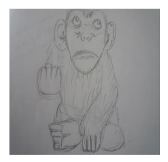
Figure 5. A large figure represents a problem. The monkey is a metaphor for ignorance and it is at the center of the picture which means that the monkey is a problem.