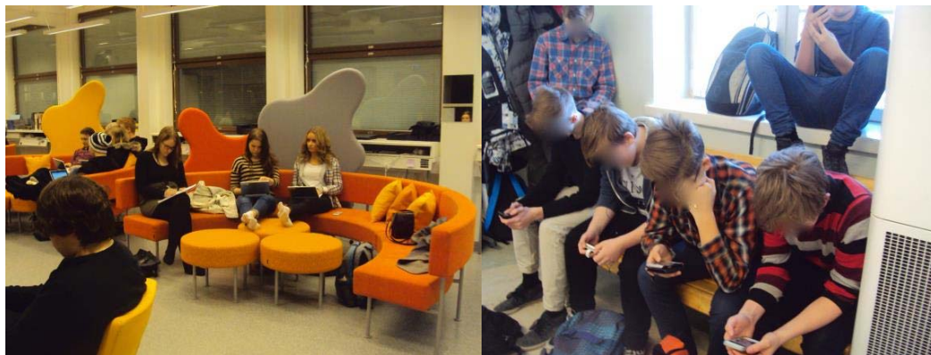
Figure 2. Technology-mediated communication is today integral part of the learners' practices both in the class and during a break.

From a spatial design point of view, learning can be regarded (in a technical consideration) as navigation (e.g. Tversky & al., 1999; Tversky, 2008, Lievonen, 2015): a trajectory of attention shifting from object to object relevant to a topic (of interest). In a conversation and collaboration, joint attention functions as a platform for gaining a shared understanding of an object of reference (Diessel, 2006). From a spatial design point of view, an important question is how a joint attention is established, and how the audience's attention is guided to the object of reference. To take a traditional lecture as an example, the gaze direction of the audience focuses on the objects indicated by the lecturer/presenter at the front of a lecture theatre. In a hybrid session, a joint attention may be established on the same spot in the front, or, on the participants' laptop/tablet screens. In the latter case, the learners lack the rich procedural information through the gestures of the presenter. Even though it is possible to guide attention e.g. by a cursor, such guidance is less rich compared with being able to register facial expressions, bodily gestures and the teacher's or other presenter's gaze contact.