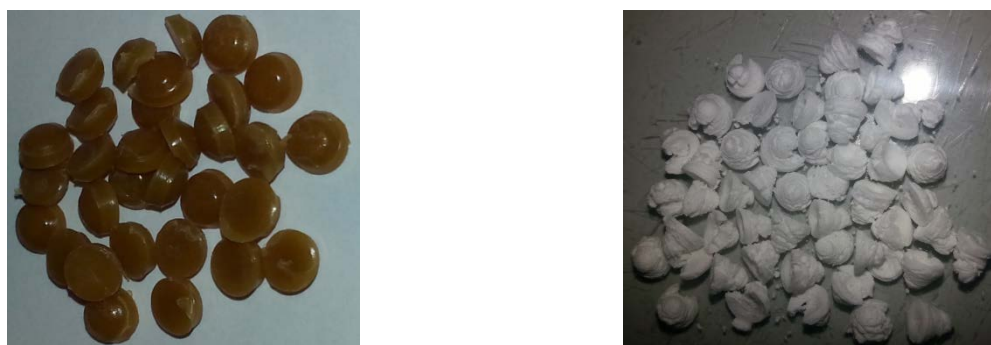
Fig. 3a) PVC (NMIJ 8123-a) pellets before autoclave digestion method A 3b) PVC pellets after the digestion method A