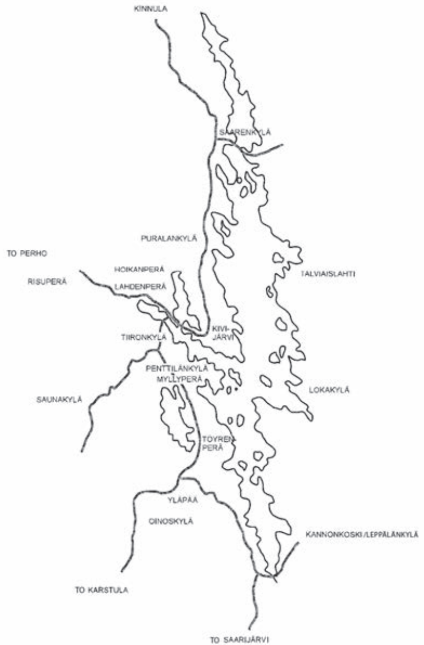
Map 3. The villages of Kivijärvi.