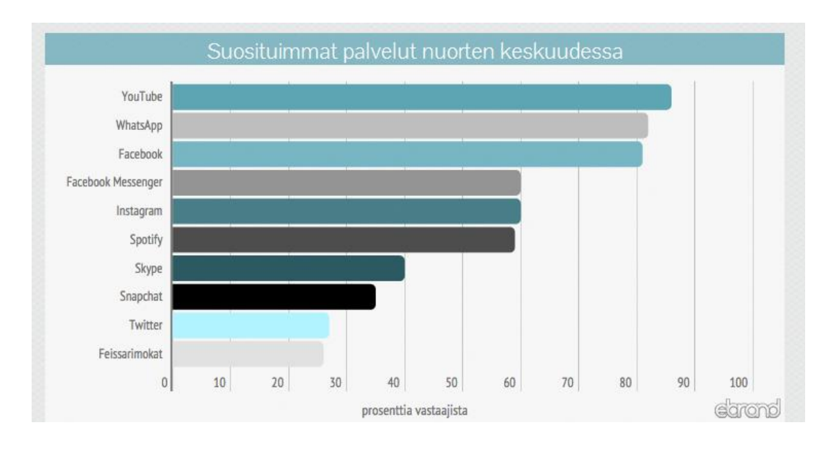
Figure 2. The most popular social media services

(http://www.ebrand.fi/somejanuoret2015/tiivistelma/)