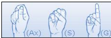
Figure 2: Handshapes (images from SUVI 4 )

too. For example, discrimination of a phonological handshape variant can be problematic because the borderlines between handshapes are vague. We have considered whether it is essential to discriminate between e.g. variants of the sign ISÄ(Ax) 'father' and ISÄ(S), because the handshapes closely resemble each other (see Figure 2). However, in FinSL both handshapes appear frequently in the sign. Are they lexicalised signs? In our work, a third variant with the handshape (G) was more easily annotated as a separate gloss because this handshape was clearly different from the handshapes (S) and (Ax) and because annotators can identify the sociolinguistic feature of the sign ISÄ(G): older signers typically sign with handshape (G).