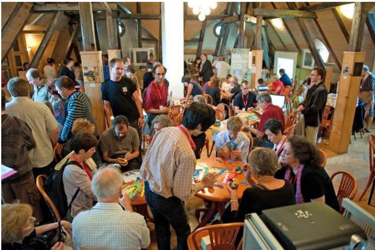
Figure 11: Dozens of fun activities at Bridges Family Day.