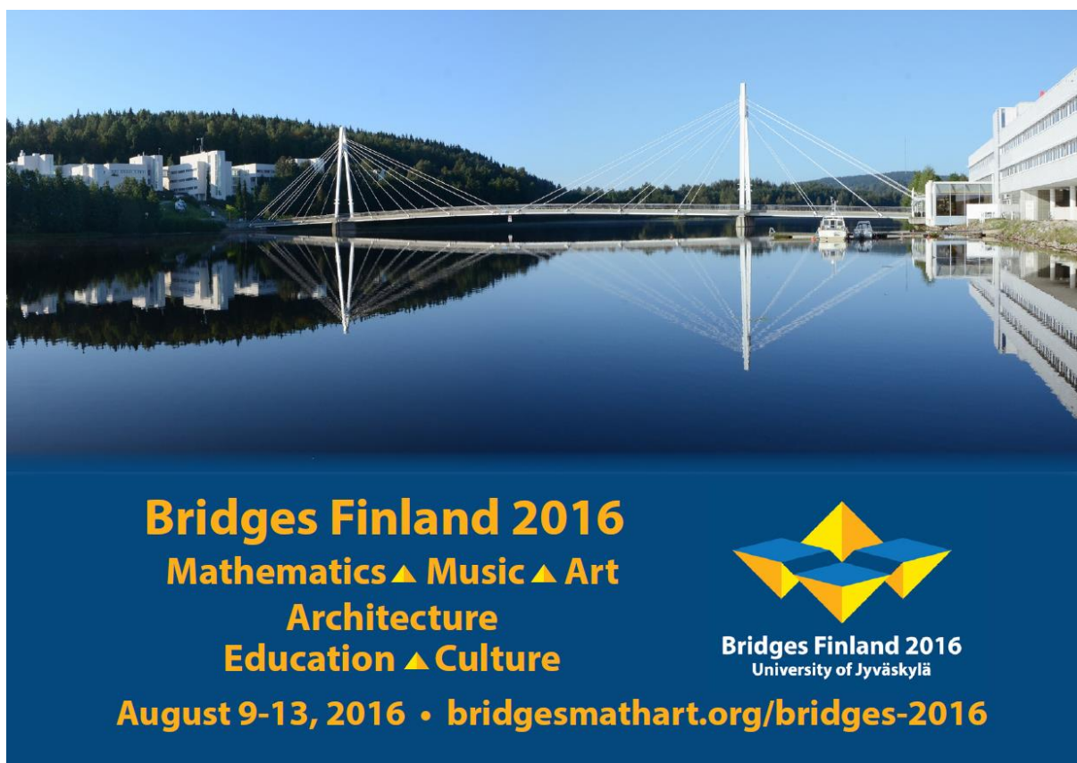
Figure 6: Invitation postcard for Bridges Finland 2016, hosted by the University of Jyväskylä.

The resounding success of Bridges 2003 in Granada, Spain (organized together with ISAMA) – in the shadow of the Alhambra, one of the greatest math-art works in history—prompted the organizers to hold future conferences in tourist destinations, and include thematic day-trips. Bridges conferences have been held in Winfield, USA (1998-2001); Towson, USA (2002) ; Granada, Spain (2003); Winfield, USA (2004); Banff, Canada (2005); London, UK (2006); San Sebastian, Spain (2007); Leeuwarden, The Netherlands (2008); Banff, Canada (2009); Pécs, Hungary (2010); Coimbra, Portugal (2011); Towson, USA (2012); Enschede, The Netherlands (2013); Seoul, Korea (2014); and Baltimore, USA (2015). In 2016 Bridges will embark on its first Nordic conference, held at the University of Jyväskylä in Finland, the most northern location ever to host a Bridges event. 22