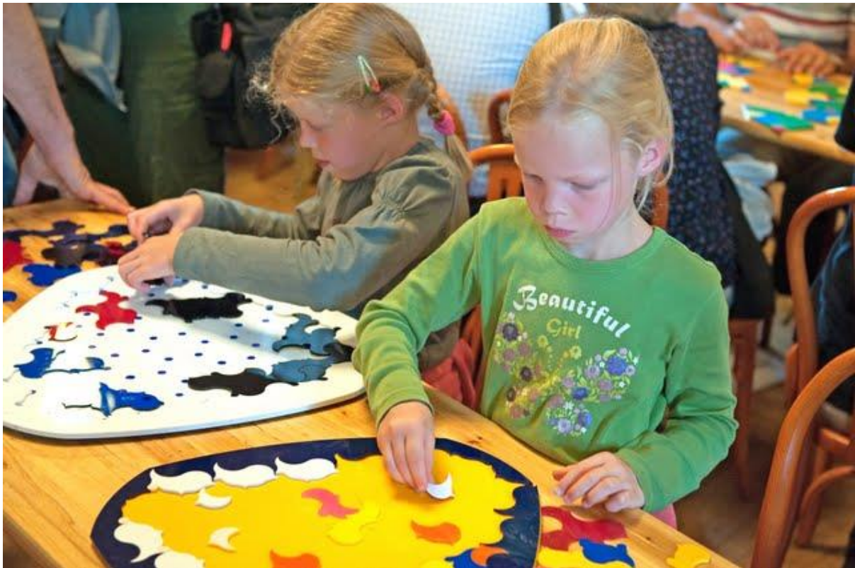
Figure 12: Girls playing with Gábor Gondos Bridges participant's math-art puzzle.

Today, as changes in the world bring about unseen alterations in the structure of knowledge, any form of research, learning, or creativity capable of heightening awareness toward interlocking systems possesses untold value. First and foremost, knowledge such as this allows one to preserve a sense of exploration and inquiry, elements essential to all rational and creative activities. Without these, the ability to recognize those patterns and trends dictating current changes is lost.