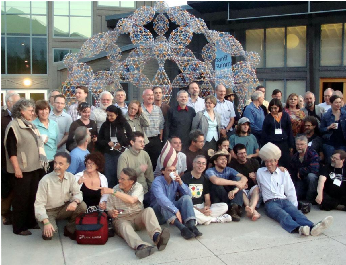
Figure 1: A colorful group of Bridges participants in front of the Gossamer Zometool model, a massive sculptural tribute to the late architectural visionary, Jean Christoph Kling, at the Bridges 2009 “Renaissance Banff II.” conference. Five meters in diameter and assembled from 50,000 Tinkertoy-like parts, the gossamer model was the largest of its type ever attempted. 150 mathematicians and artists from all over the world and several of their children were assembling the small plastic Zometool components into superstructures that became the final sculpture. The work took more than 250 person-hours, performed during breaks between presenting and attending talks. Although the model is built entirely from points and straight lines (i.e., nodes and struts) the model looks like a 3-dimensional “spirograph” drawing, with organic curves that mimic life forms. The underlying structure is derived from a shadow of a 6-dimensional cube.

From its beginnings in 1998, Bridges has advocated for mathematics as a core component of STEM (Science, Technology, Engineering, Mathematics) education. Years before the STEM acronym was even created [Christenson, 2011] and spread, Bridges had humanized it. The Bridges community has never had to expand its approach from STEM to STEAM (Science, Technology, Engineering, Arts and Mathematics): it has always included those aspects of the arts, design, creative thinking and artistic imagination so very necessary to, yet still so very lacking from many STEM projects today. From its inception Bridges has given the STEAM movement inspiration for a transdisciplinary and intercultural platform.