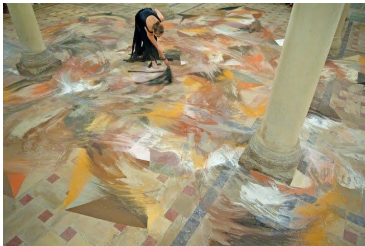
Figure 5 a, b, c: “Worldsand” ( Sammlung Weltensand ) composition at Bridges 2010 by Elvira Wersche, who collects different types and colours of sand from all over the world and uses it to construct complex mosaics, composed of geometrical patterns, on the floors of museums, churches and synagogues. When the artwork was finally ready, a dancer literally erased the carefully constructed pattern. By doing so, the artist emphasized that everything is in constant flux and everything is only temporary.