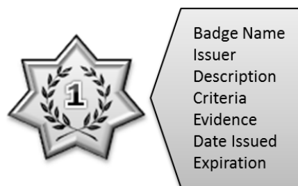
Figure 1. Metadata of a badge conforming to the Open Badge concept.

All kinds of metadata can be affixed to a learning badge (Fig. 1). Typically, the added information consists of the details of the issuer of the badge and the criteria on the basis of which the badge was issued as well as evidence substantiating the competence. The metadata usually also includes the date of issue of the badge and when required also its date of expiry. The metadata is in the form of hypertext; thus it can contain information that is quite variable and also for example links to external sources of knowledge.