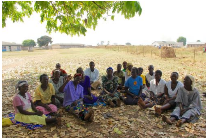
Group of Akem Kwee women dancers in Anaka

I would like to end this thesis with my favorite encounter and story. During my fieldwork, I met a group of women dancers who had known each other from living together in Anaka camp and had always danced as a coping mechanism during the war. After returning to their home villages, they have continued meeting together once a week to practice dancing and start a savings and loans association to support each other and save money to be able to send their children to school. After a year, they were able to achieve this goal and prove to their husbands that their empowerment was beneficial to the household. Some of their husbands have now joined the cooperative, and they have been performing in various places.