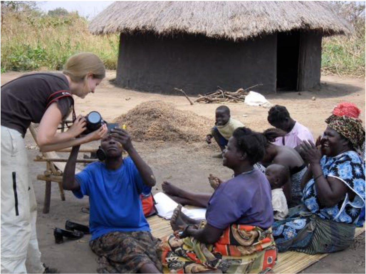
This photograph was taken by one of my participants without me noticing.