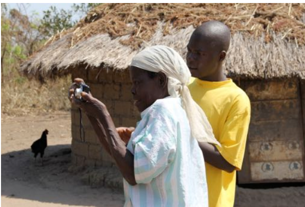
Photo-voice approach & ethnographic photography

In order to give a chance to my respondents' to express their lived experience through images, I chose to employ the photo-voice method. Photography is a process that has the potential of reflecting the communities back upon themselves and revealing the daily social and political realities that have an impact on people's lives.