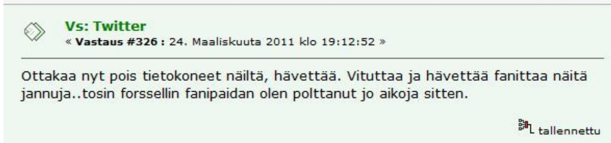
Figure 2. Responses by members of Futisforum2 to Mikael Forssell's Twitter language use.